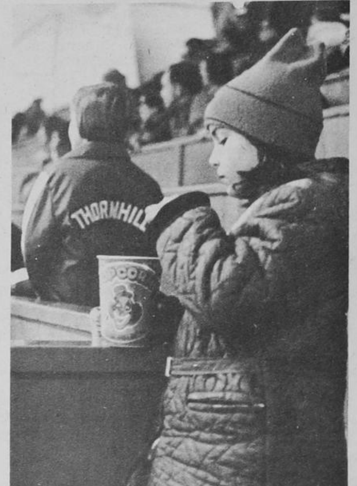
Taking Thornhill's defeat all in her stride is this young girl who figures the best way of getting rid of your frustrations is to take time out for a popcorn snack.