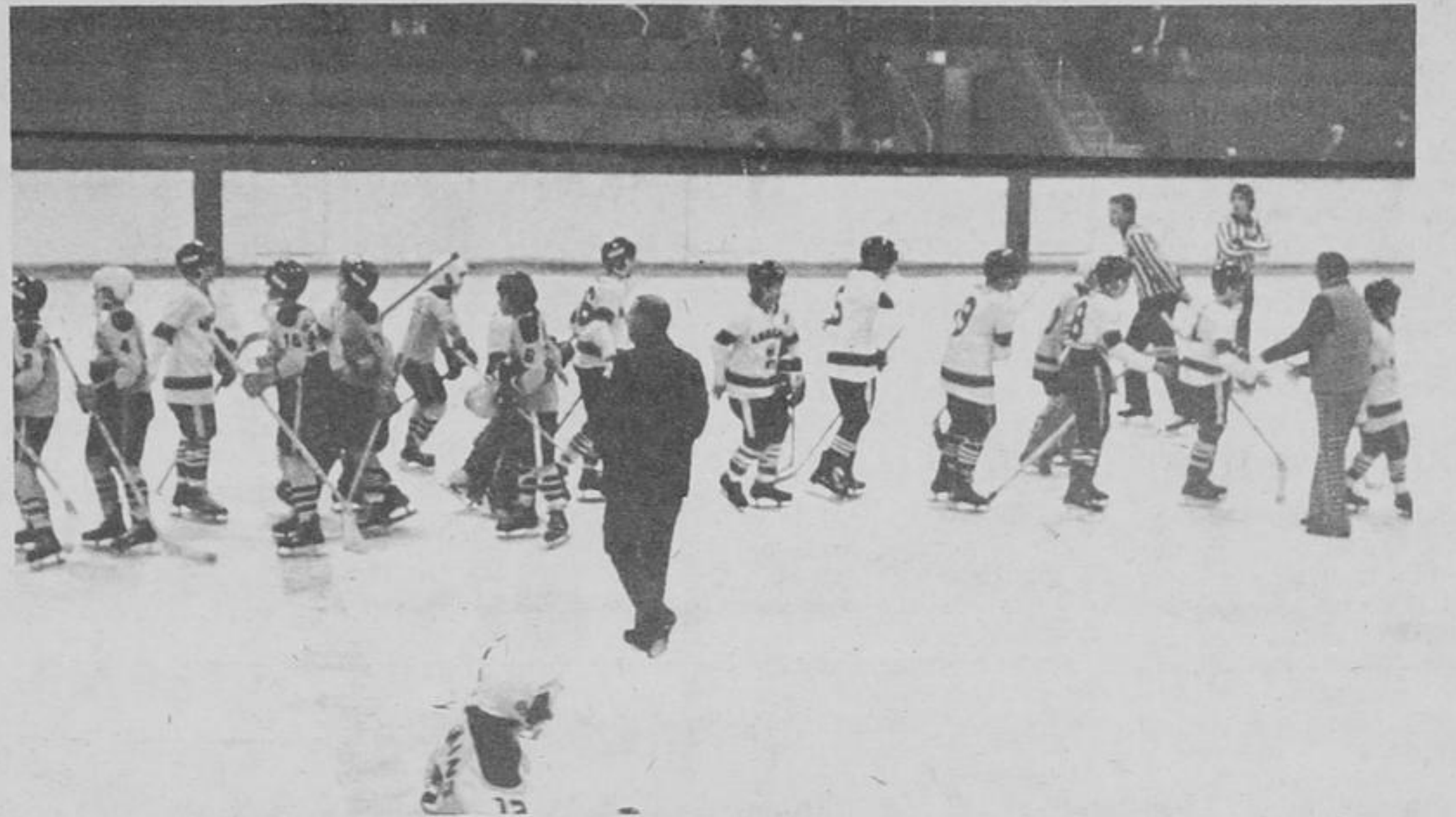
A familiar game-over ritual is performed as members of the Oak Ridges and Amherst teams leave the ice. Oak Ridges, incidentally, lost a toughie