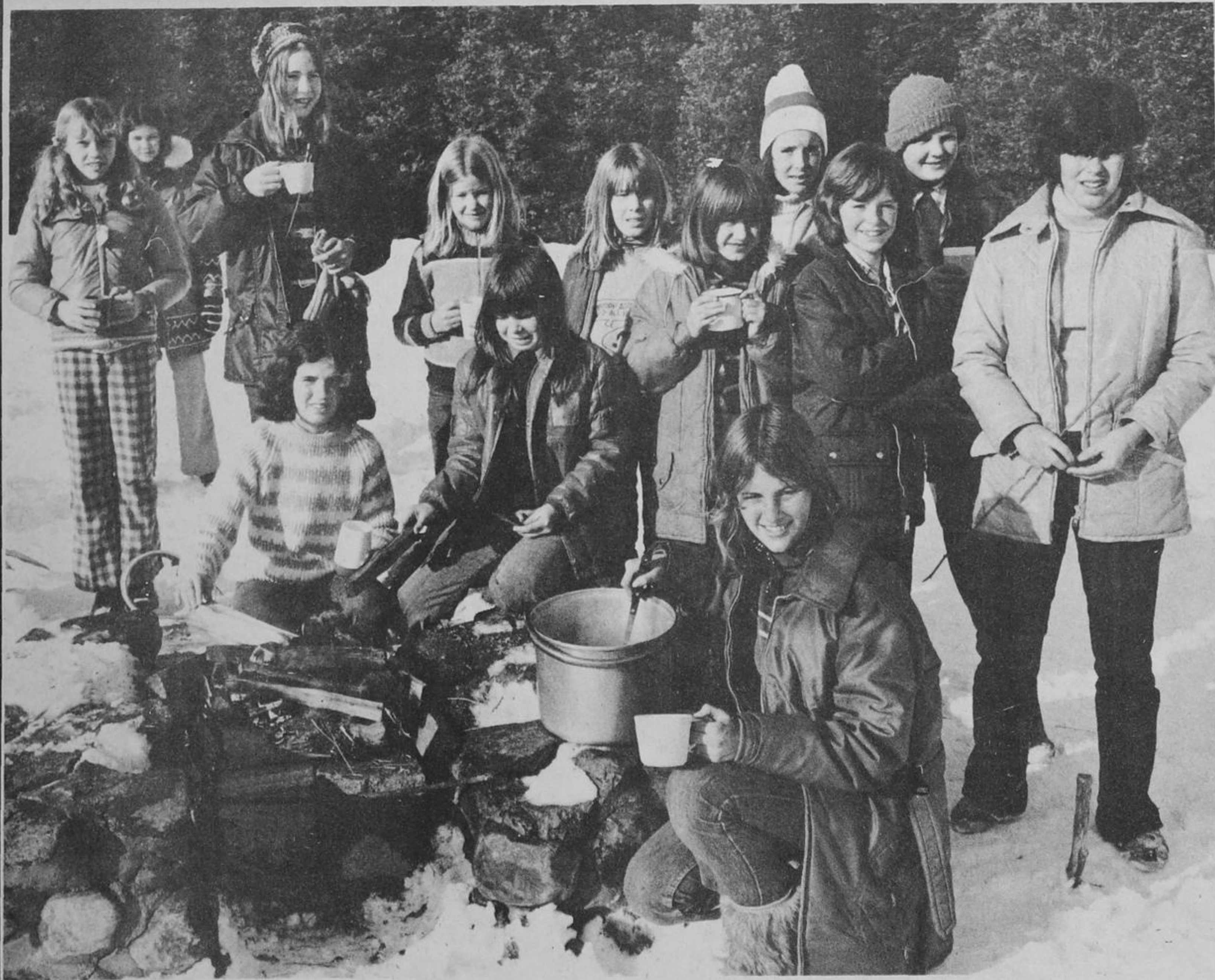
Fun in the snow

Twenty members of the 2nd Thornhill Guide troop braved the wilds of interior King Township this weekend to prove winter camping can be fun. They slept and cooked most of their meals in cabins at