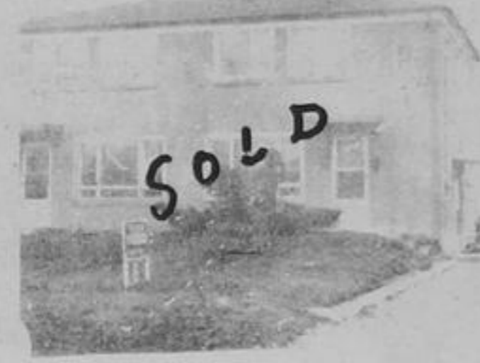
278 St. Taylor Mills

These homes were LISTED and SOLD last month