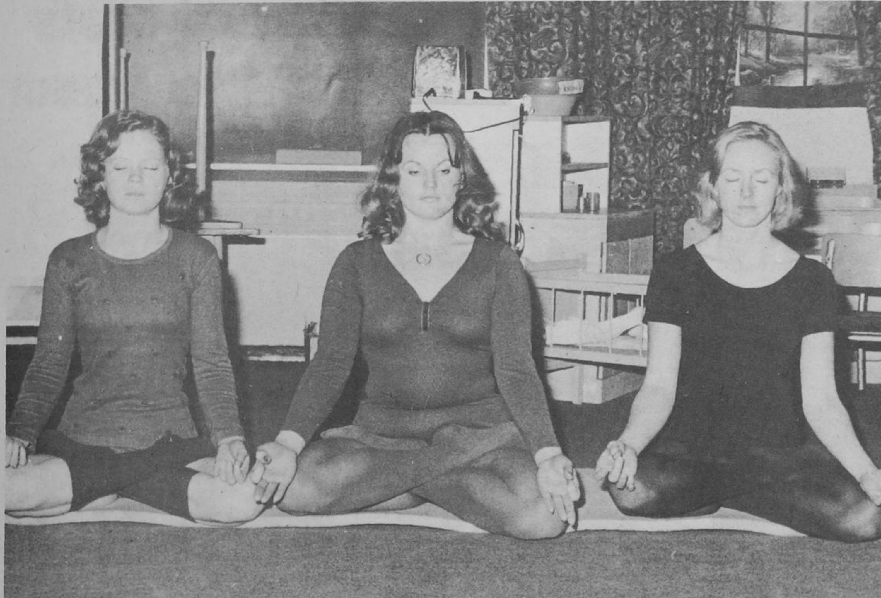
They find it relaxing

Yoga, the Hindu form of meditation, is practised each Thursday evening at Joseph A. Gibson Public School, Maple. A group of 12 women are helped by their instructor