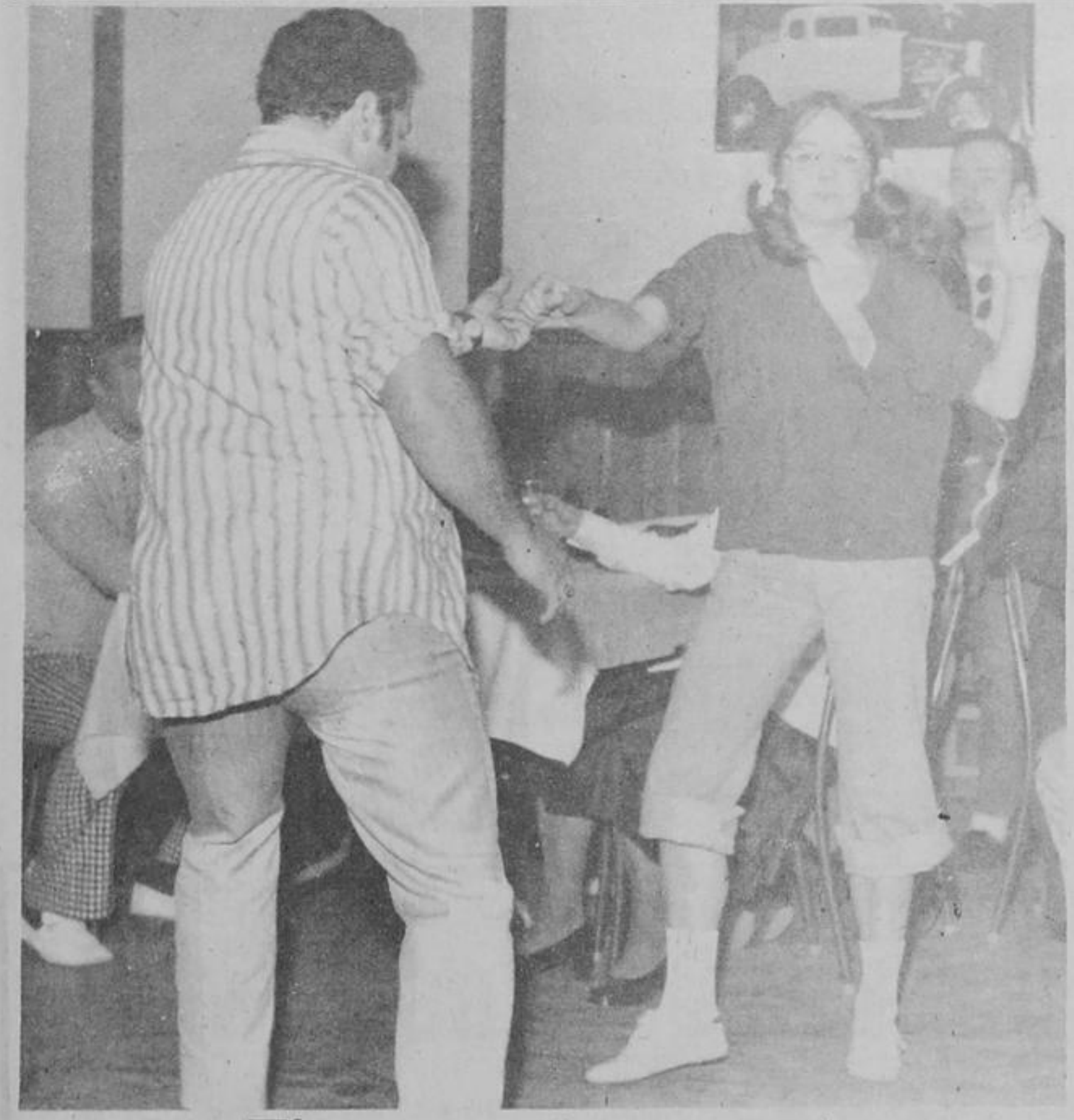
Theatre arts rug cut