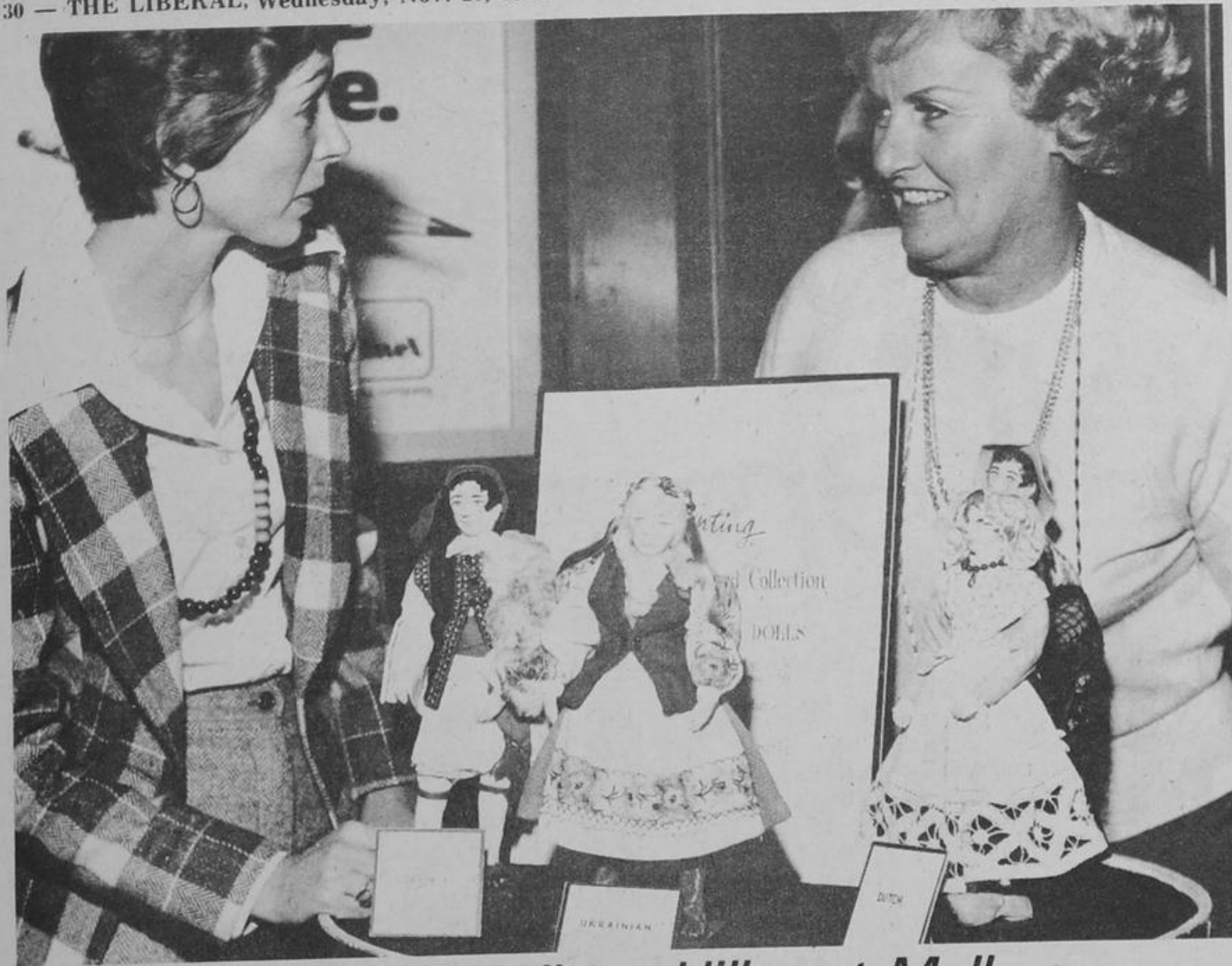
Historic dolls at Hillcrest Mall