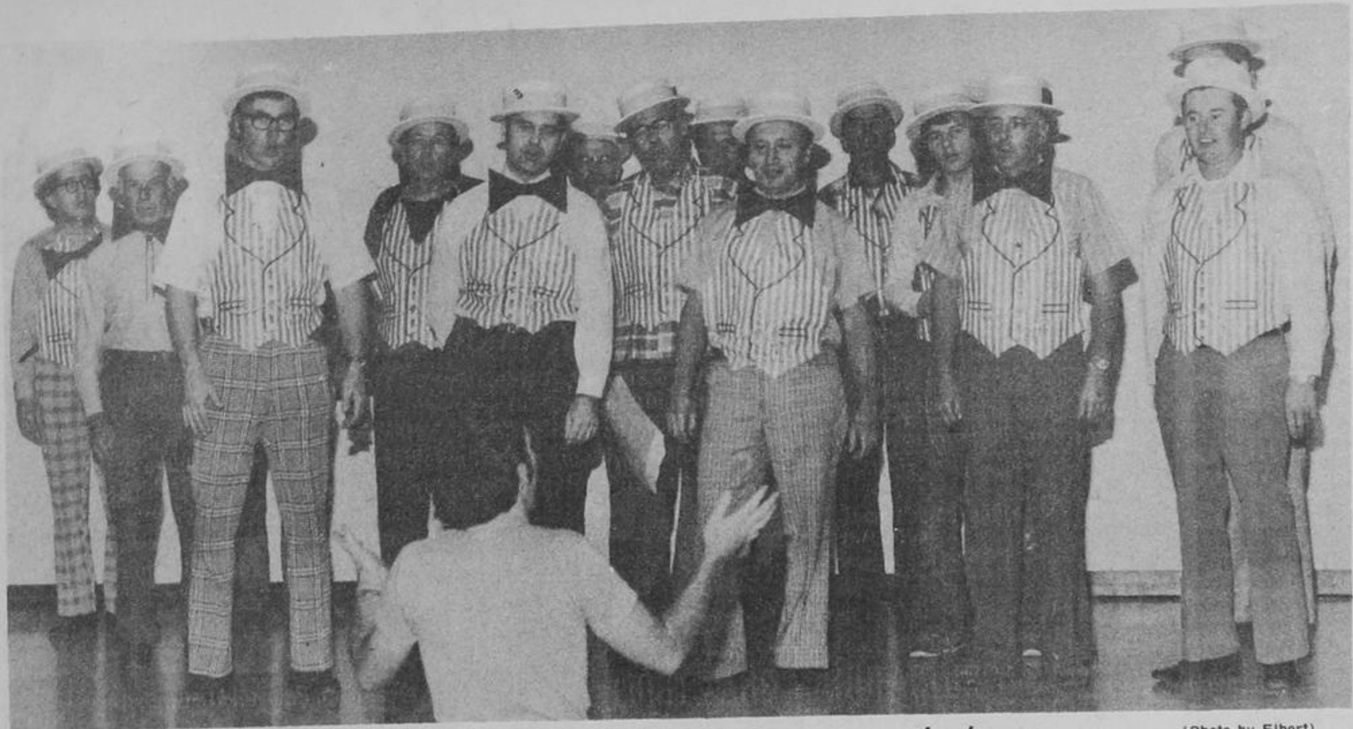
Kingsmen preparing for annual show