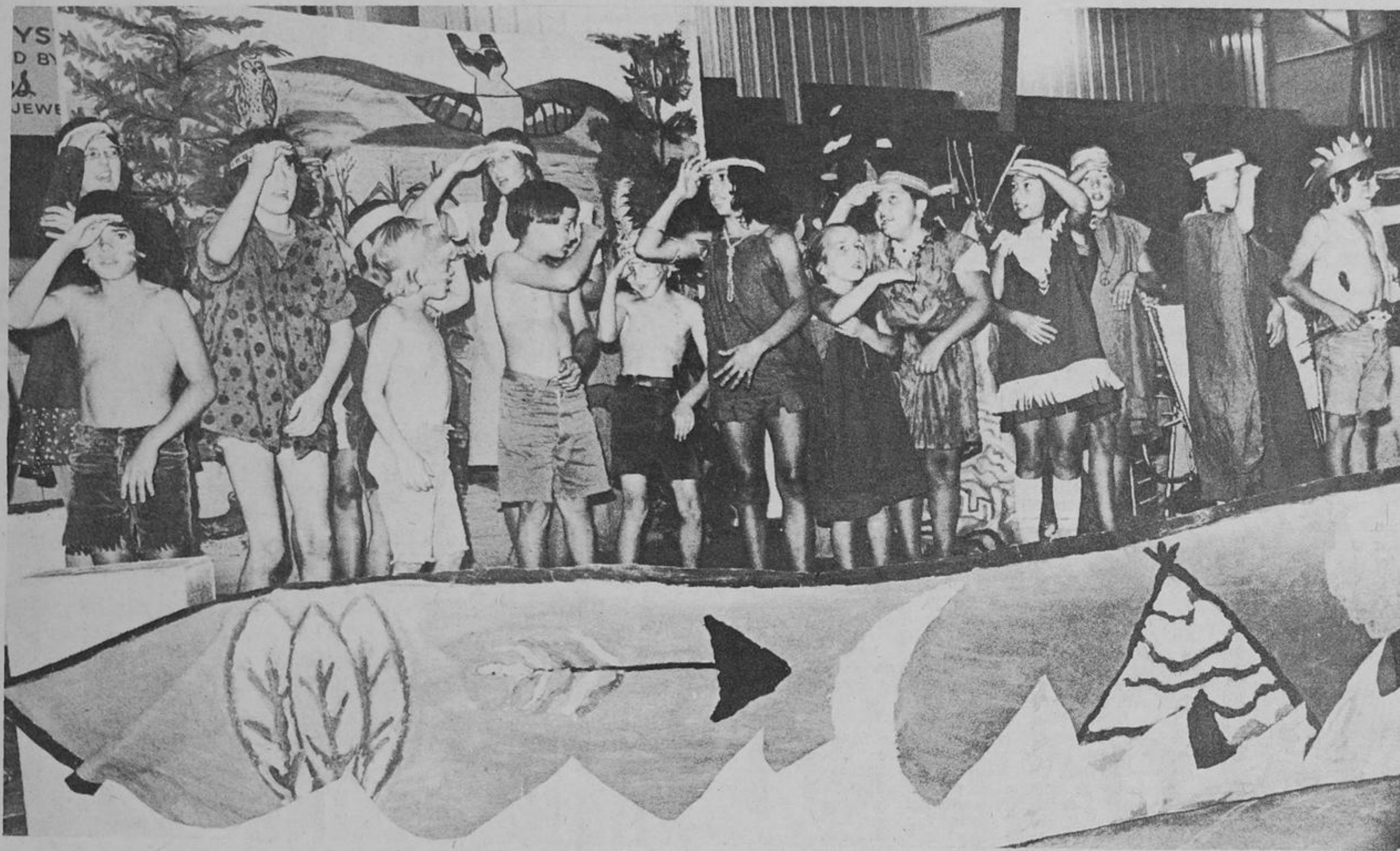
In a fine setting created by forest and totem pole, with canoe lying across in front of them, children in the recreation program at 16th Avenue Public School in Richvale present an interpretation of Indian life including poem, skit and song.

softball, track and field, swimming and trampoline, crafts, movies, excursions to such places as Seneca College, Ontario Place and various conservation areas.