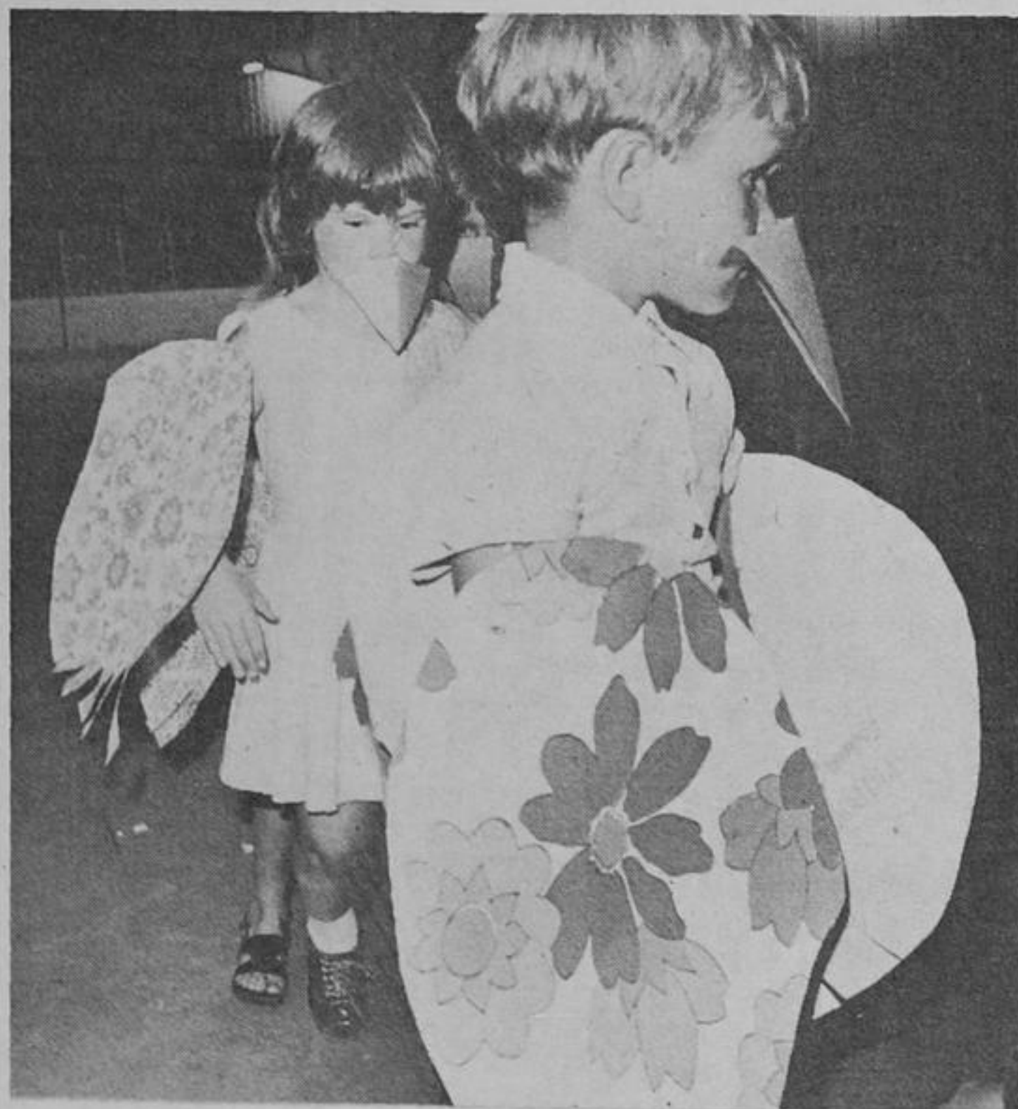
Three young ducks were out for Summerfest '74 from among the children who attended the morning summer recreation sessions at Walter Scott School on Markham Road.