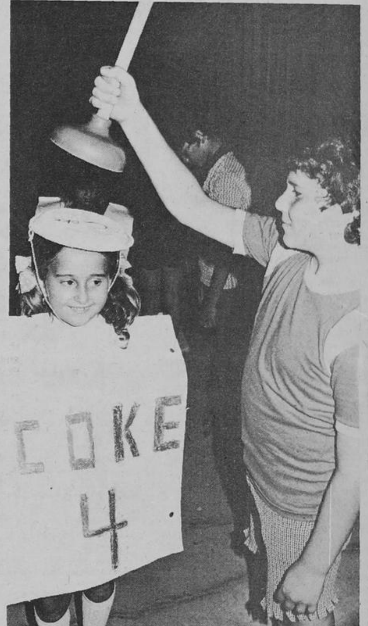
Through poem and skit, the children at Ross Doan Public School on Weldrick Road in Richvale, led their audience into the world of a soft drink factory. Here a filled and labelled bottle is getting capped!