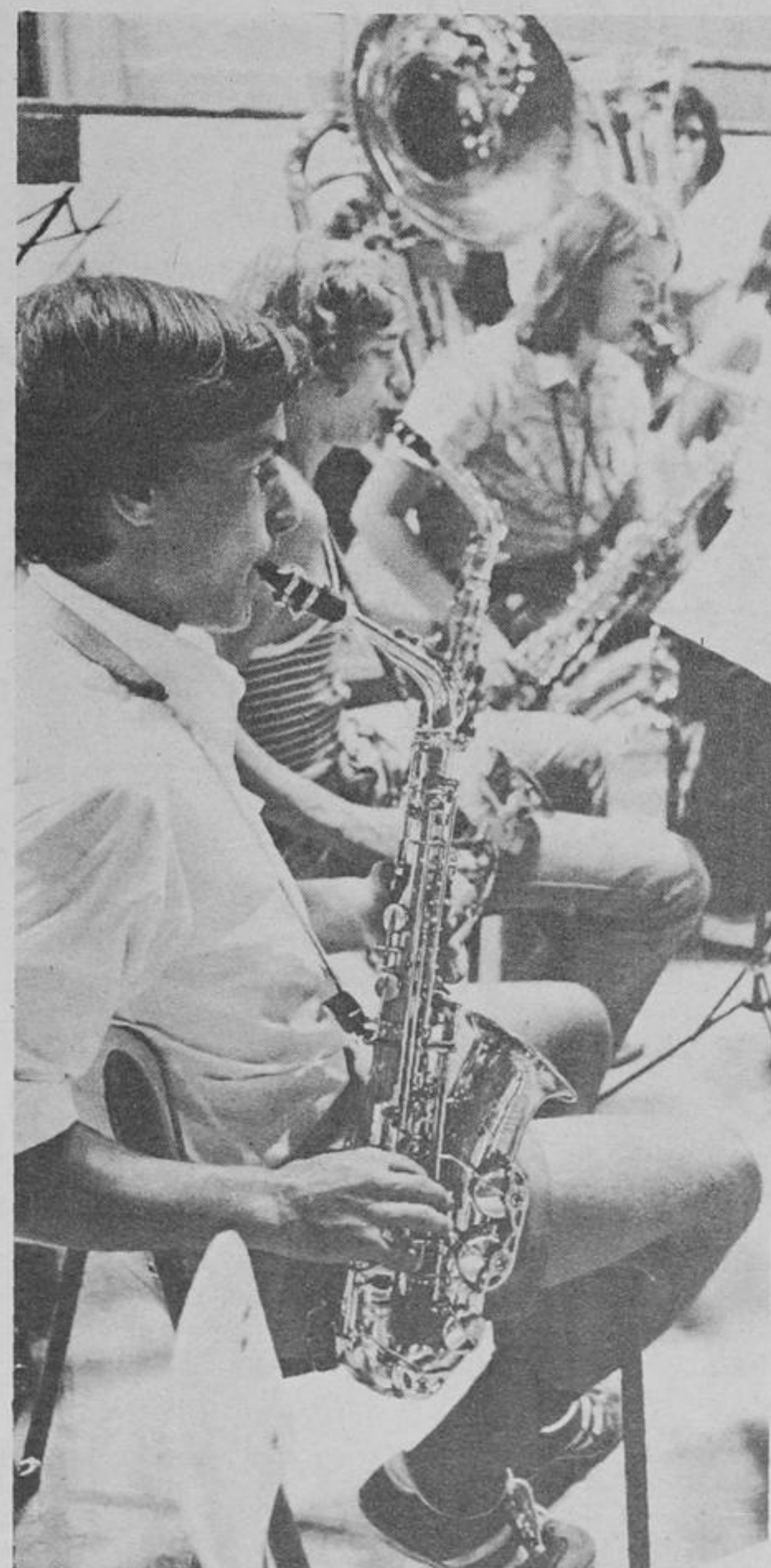
Music provided at the Summerfest '74 program at the Richmond Hill Arena rounding up the summer's town recreation program was provided by the Richmond Hill Youth Concert Band. The musicians contributed greatly to the success of the evening.