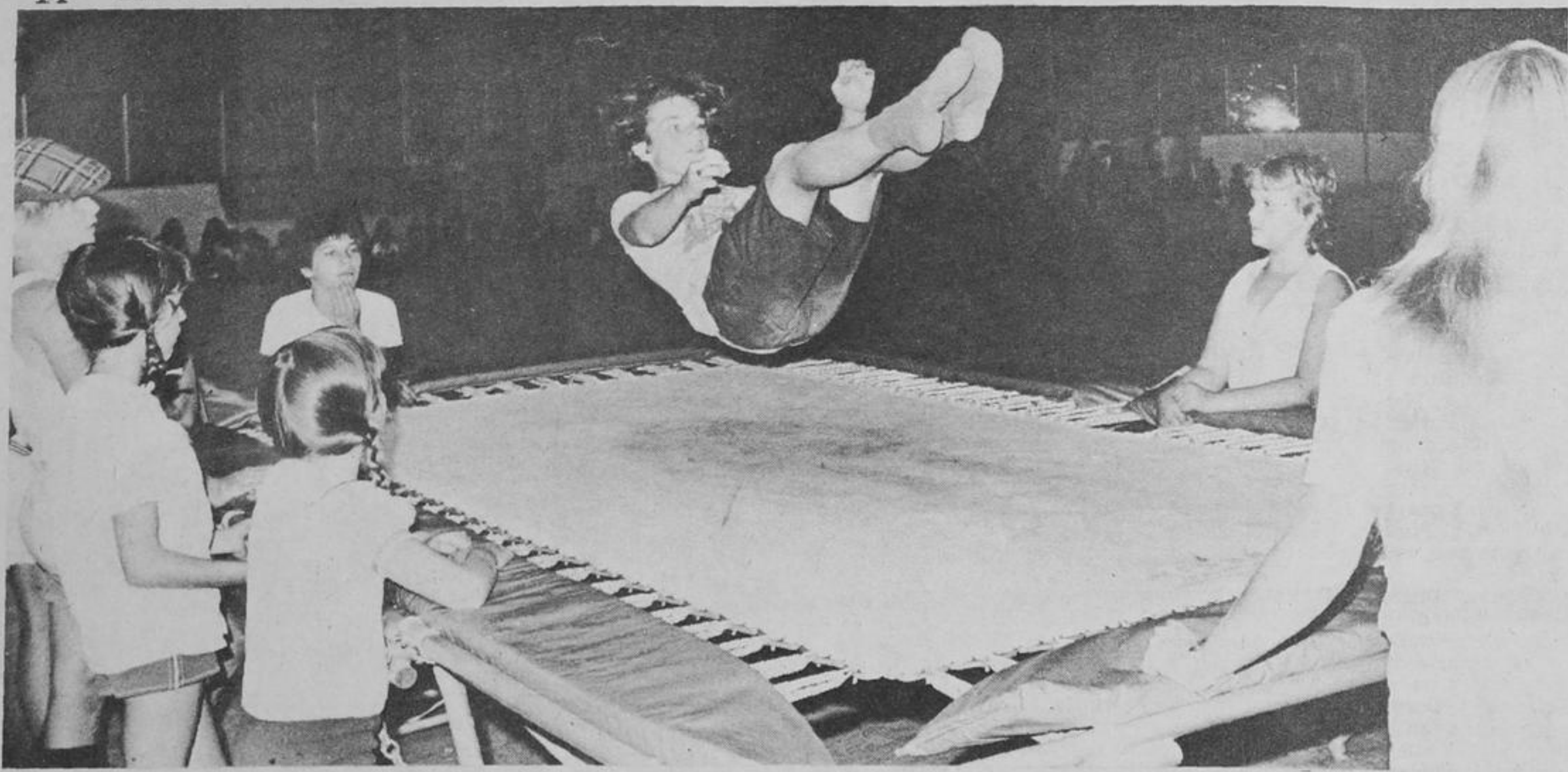
Children from the Charles Howitt Public School on Pearson Avenue in Richvale demonstrate trampoline skills and fun.