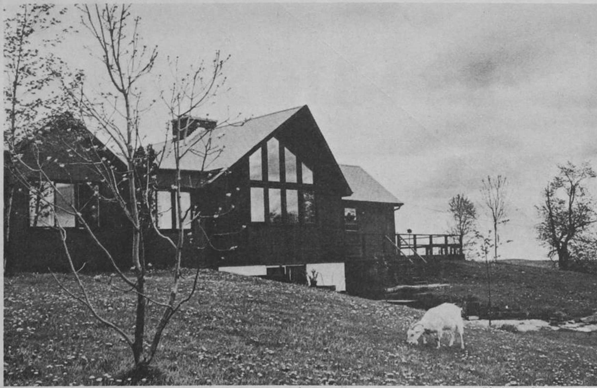
This four-year-old house by a Maple builder on a 16th Sideroad hilltop is one of those featured this year in the York Humane Guild's tour of King Township country homes.