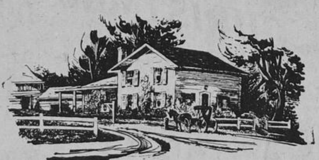
The Doctor's House Restaurant and Tavern

In Kleinburg is now open all year featuring excellent, early Canadian cuisine for Luncheons, Teas and Dinners, Tuesday through Sunday. Dinner reservations accepted up to 8:00 p.m. Fully Licensed For Reservations call (416) 893-1429 Chargex and American Express Cards Accepted A unique dining spot for those special Christmas Parties. Reservations are now being taken for Boxing Day, New Year's Eve and New Year's Day Dinner.