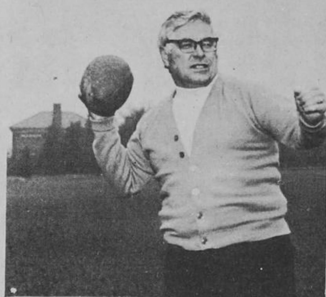
STILL GOING FOR TOUCHDOWN