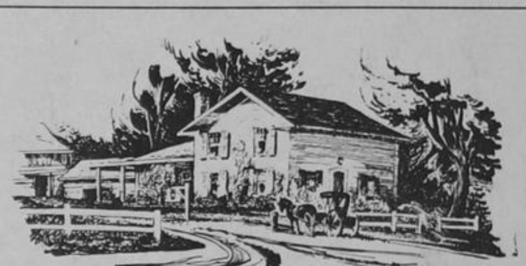
The Doctor's House Restaurant and Tavern

In Kleinburg is now open all year featuring excellent, early Canadian cuisine for Luncheons, Teas and Dinners, Tuesday through Sunday. Dinner reservations accepted up to 8:00 p.m.