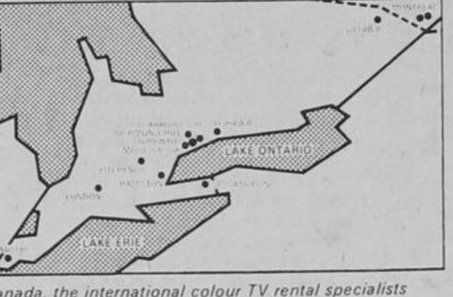
Granada, the international colour TV rental specialists with a branch in your community.

Granada same-day service... free! If you rent from Granada, the problems are ours... not yours. Just let us know if you're in trouble and within 24 hours a Granada technician, specially trained to know your set, will be out to fix it. If he can't do it on the spot, he'll give you another set to use until he can. You're never without colour TV. All absolutely free.