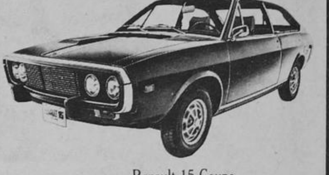
Renault 15 Coupe