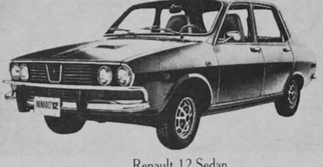
Renault 12 Sedan