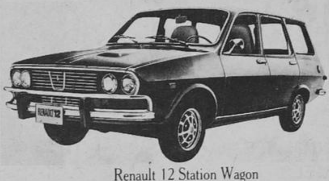
Renault 12 Station Wagon

HERE THEY GO: Get 'em while they last! GREAT '73 RENAULTS All models at beautiful prices. Come! Deal! Now!