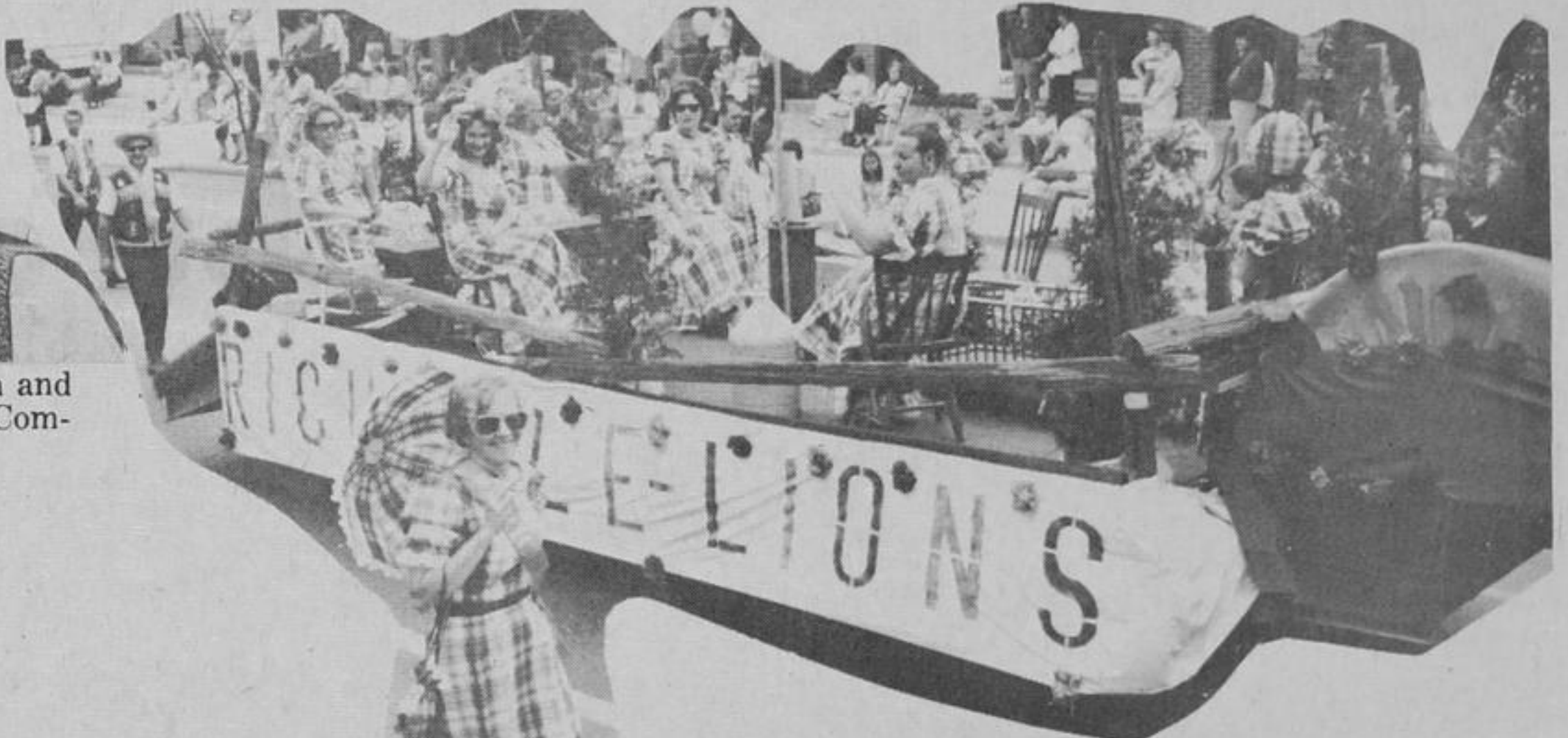
Richvale Lions — complete with float, ladies in costume and high stepping majorettes — were a major feature of the Centennial parade.