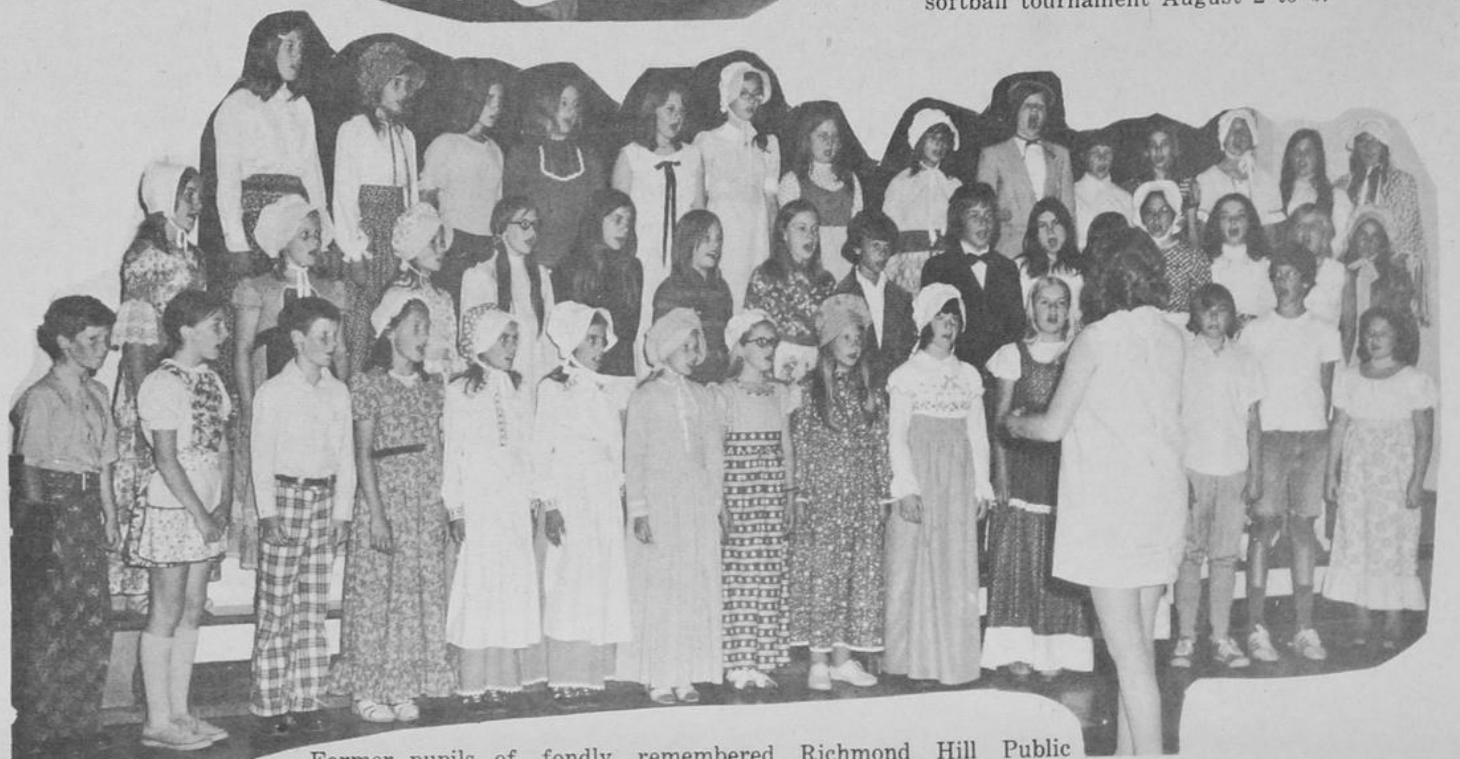
Former pupils of fondly remembered Richmond Hill Public (McConaghy) School were welcomed back warmly. There were song selections by the choir and other attractions at the school during Home Coming Week.