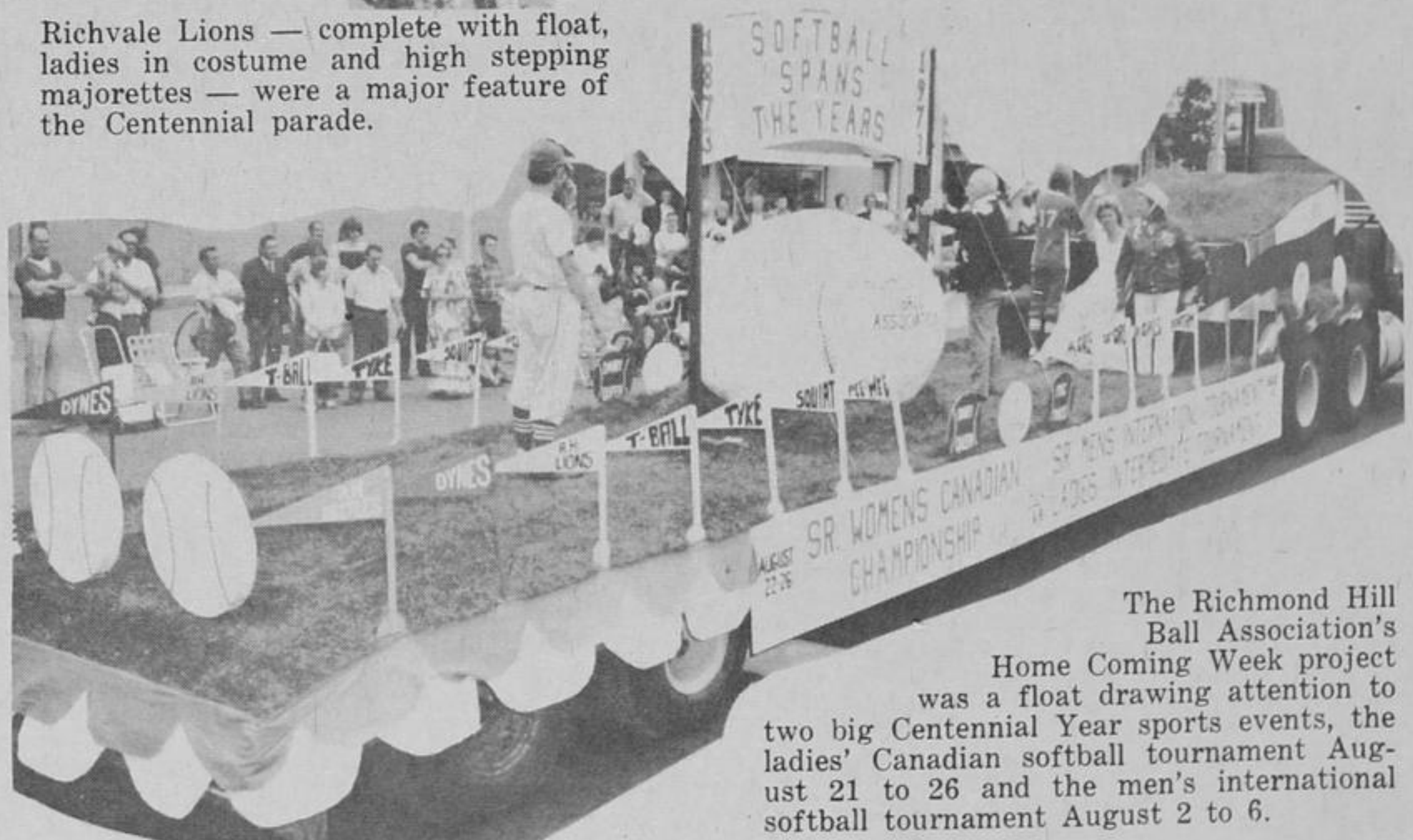
The Richmond Hill Ball Association's Home Coming Week project was a float drawing attention to two big Centennial Year sports events, the ladies' Canadian softball tournament August 21 to 26 and the men's international softball tournament August 2 to 6.