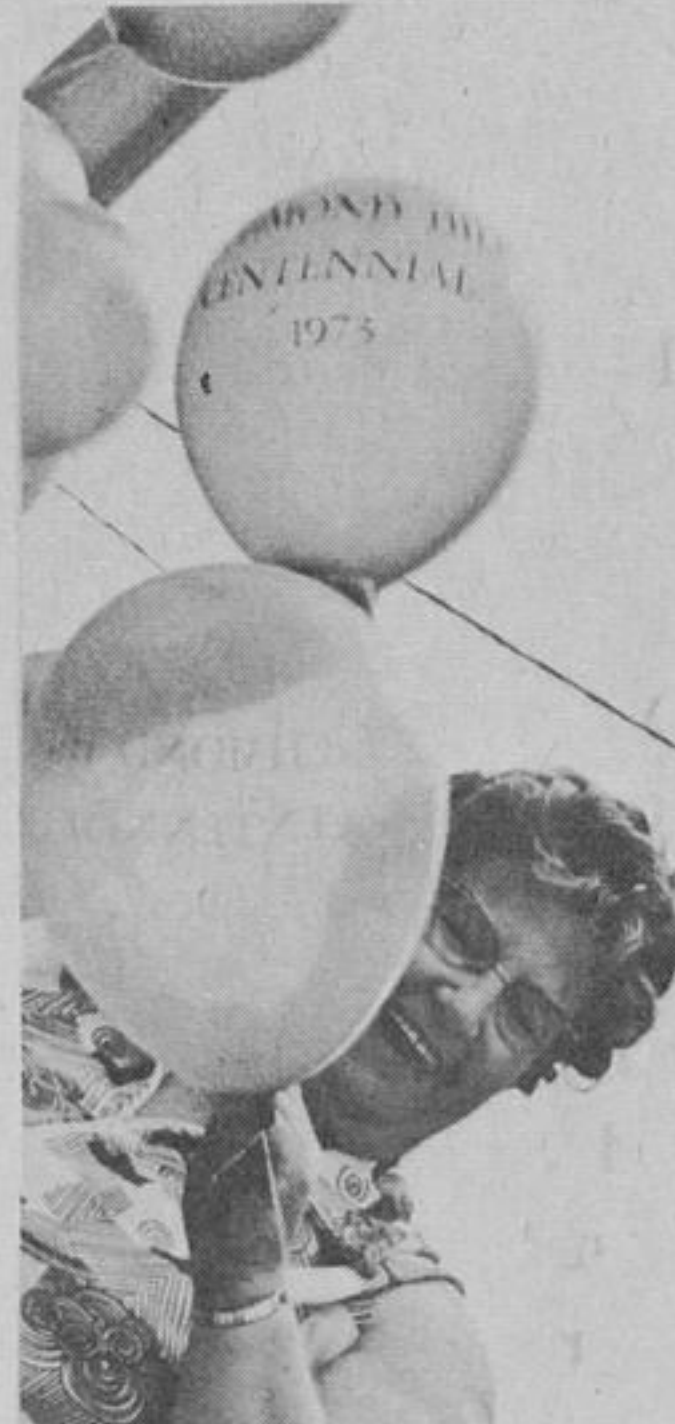
Adding color to Home Coming Week were gay balloons sold by the IODE.