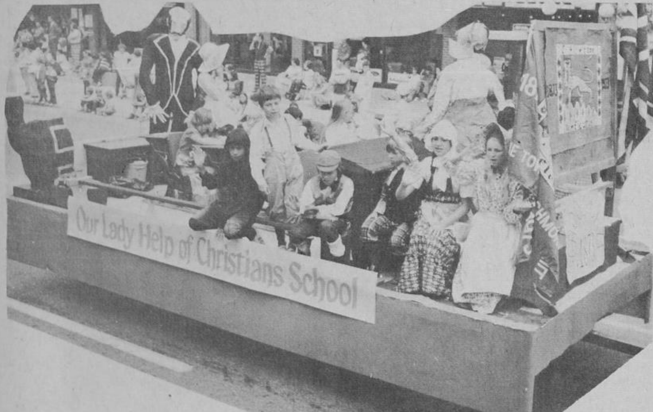
Students at Our Lady Help of Christians Roman Catholic Separate School built a float for the Home Coming Week Centennial parade.