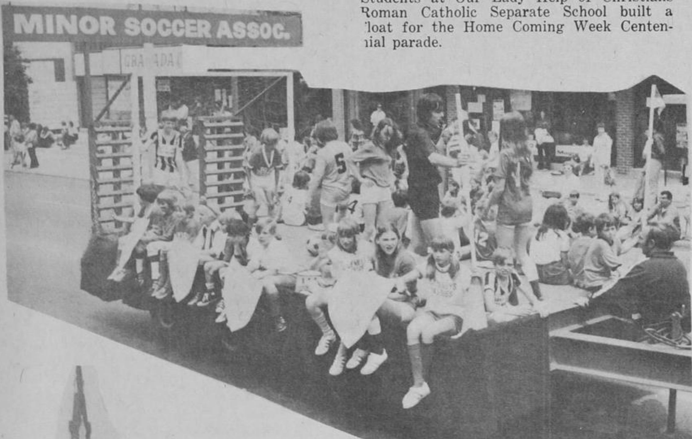
Richmond Hill Minor Soccer Association contributed a Centennial float representing the town's fastest growing sport.