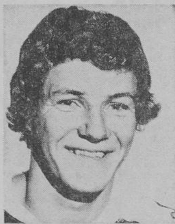
TORONTO MAPLE LEAFS DARRYL SITTLER

RICHMOND HILL LIONS CLUB BINGO MONDAY, SEPTEMBER 18 LIONS HALL 106 Centre St. East STARTING TIME — 8 P.M. Early Birds 7:40 p.m. 20 REGULAR GAMES — 3 SPECIAL GAMES JACKPOT $500 — 53 No.'s