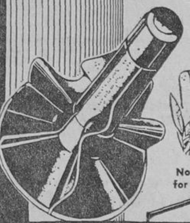
No ironing needed for Permanent Press

4 CYCLES INCLUDING SUPER WASH • COOL DOWN CARE FOR PERMANENT PRESS FABRICS • 5 WATER TEMPERATURE SELECTIONS • VARIABLE WATER LEVEL CONTROL • LINT FILTER AND DETERGENT DISPENSER • BLEACH AND FABRIC SOFTENER DISPENSERS • PUMP GUARD SPLASH GUARD HELPS KEEP WATER FROM SPLASHING OUT OF TUB.