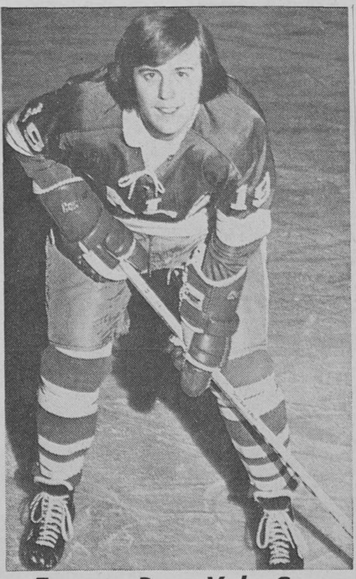
Former Ram Yale Star