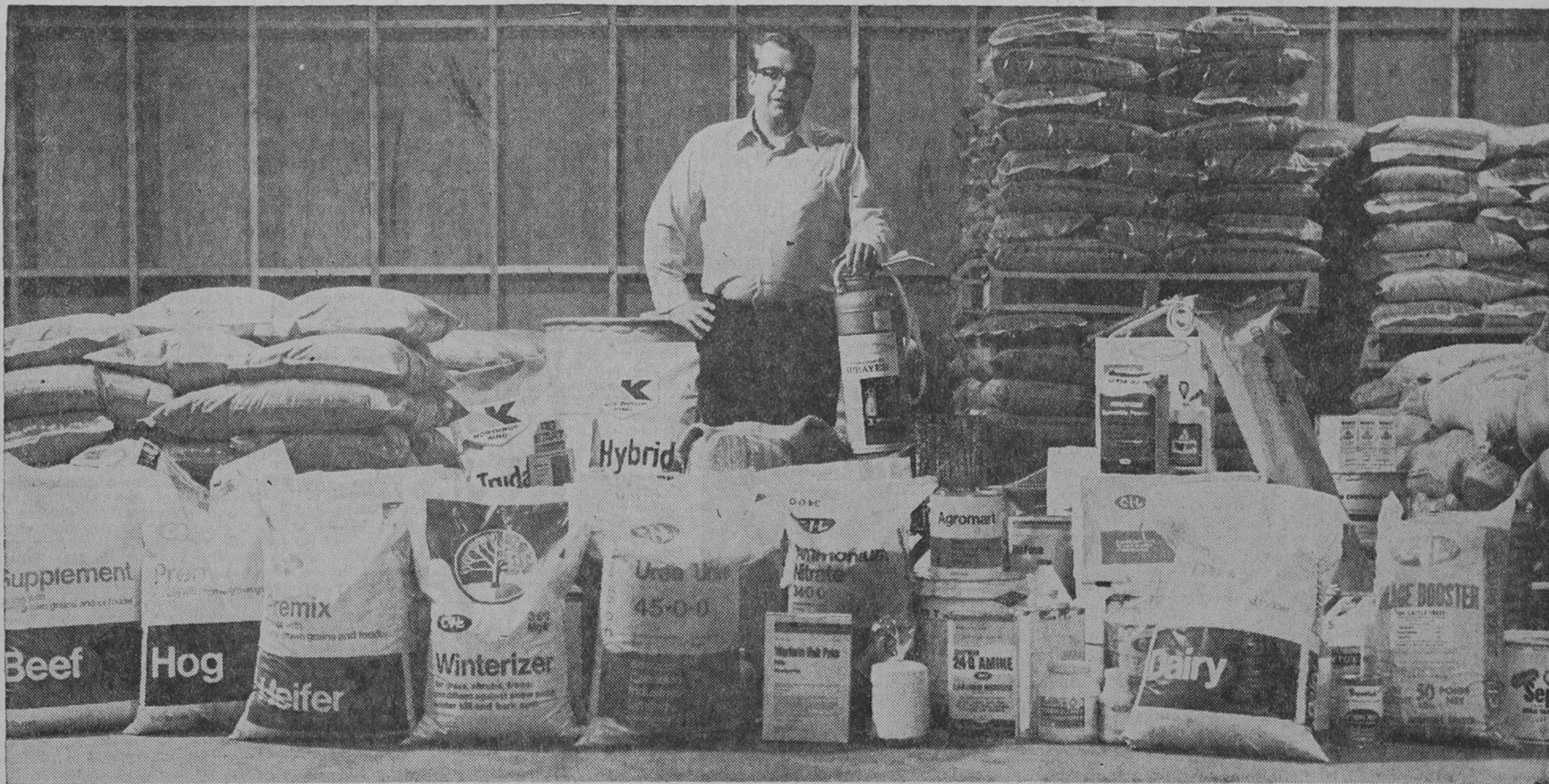
The Agromart is turning into a one-stop farm service centre with top-quality farm products and the service to back them. Come on in. The coffee pot's on the stove, and we're ready to talk.