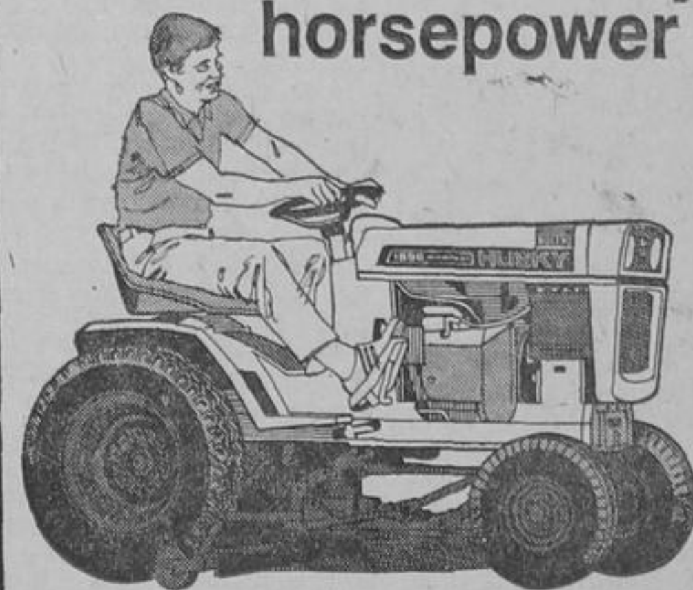
Model 1866 hitches up to a giant 54" rotary mower

TWO SPOOL HYDRAULIC LIFT FOOT PEDAL CONTROL