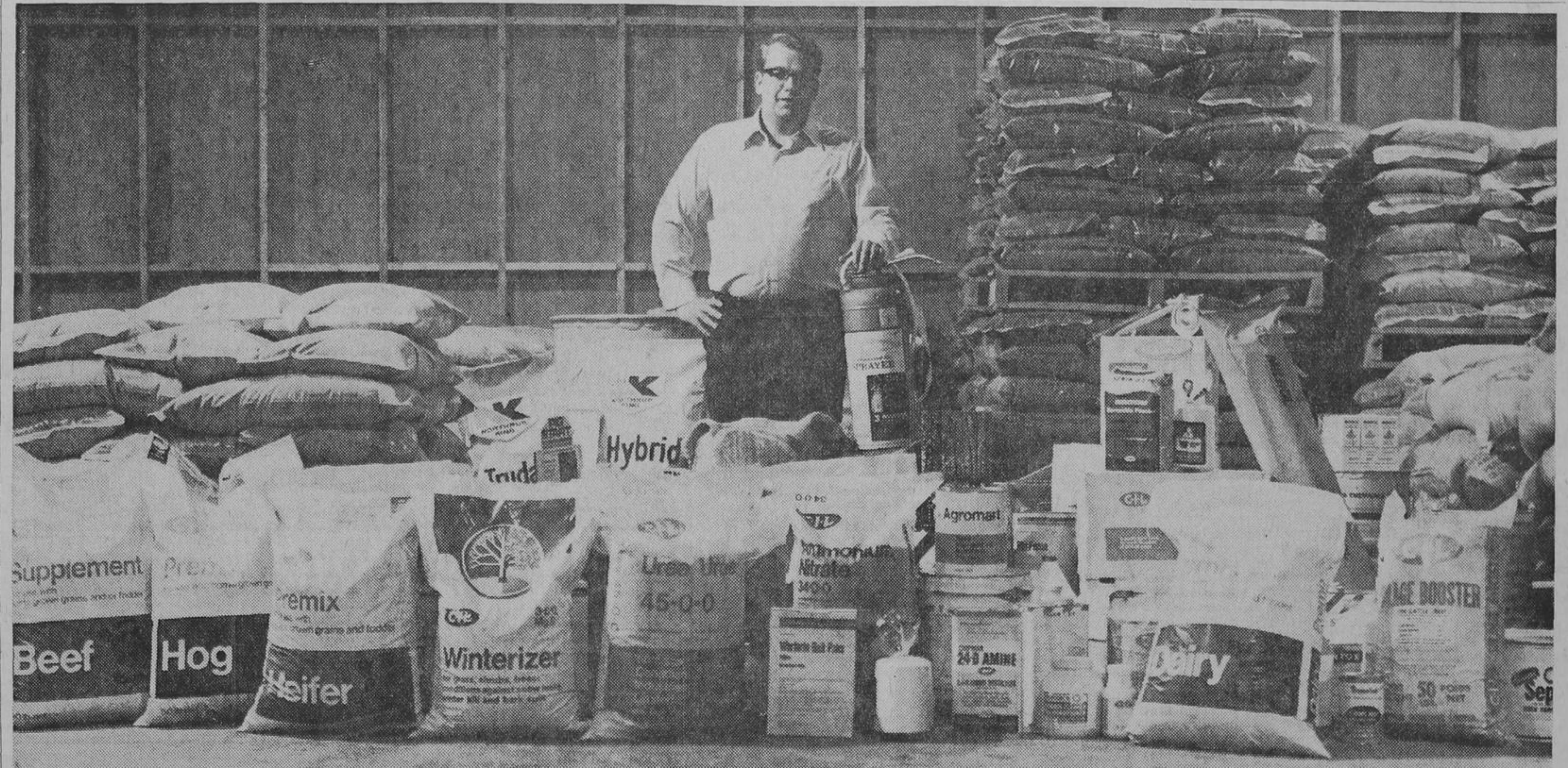
The Agromart is turning into a one-stop farm service centre with top-quality farm products and the service to back them. Come on in. The coffee pot's on the stove, and we're ready to talk.