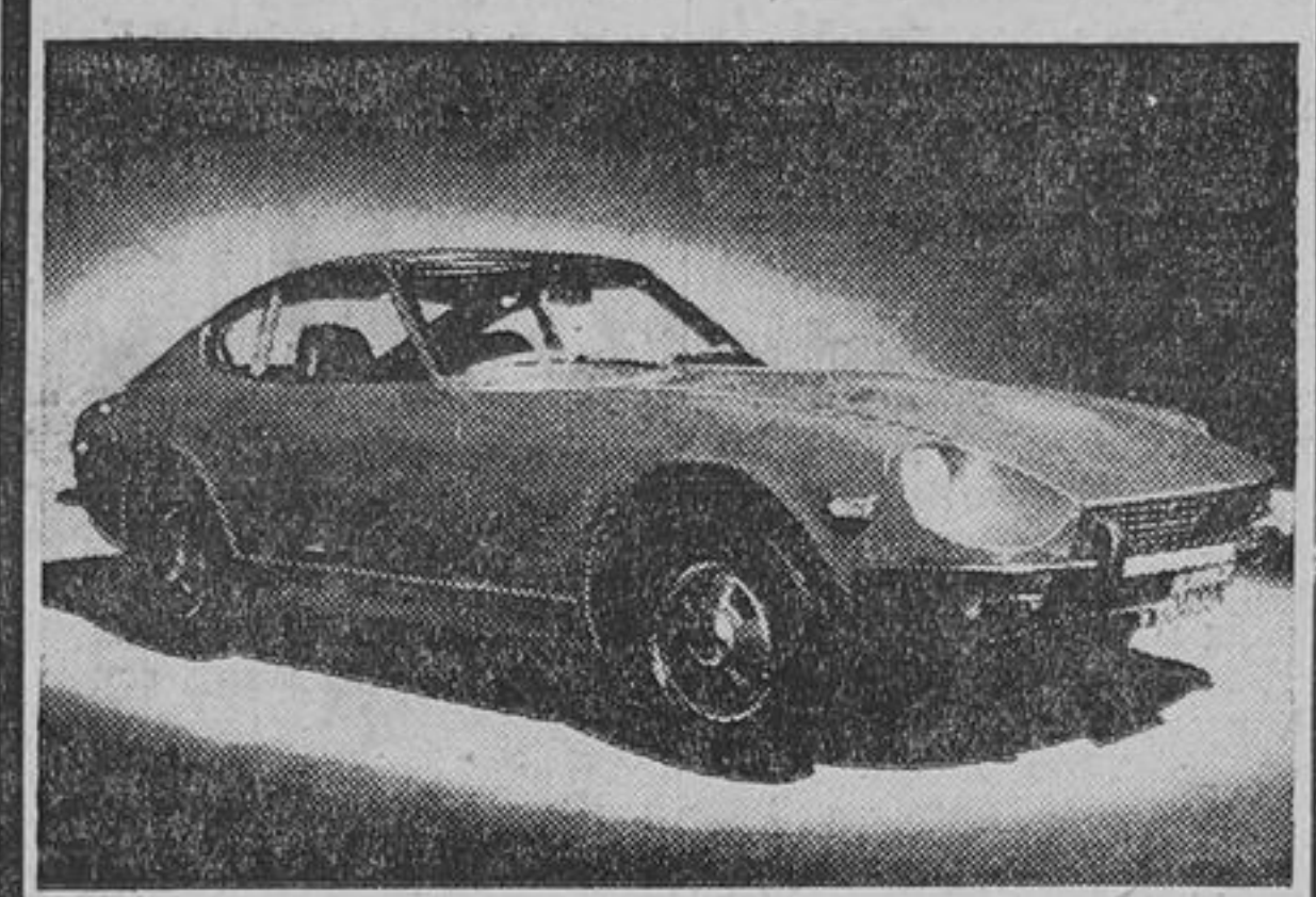
Datsun 240-Z: car experts love it. So will you.

"Road Test" magazine raves over 240-Z The editors of "Road Test" magazine really blow their minds in the review of the Datsun 240-Z. First, you must know they are a very picky bunch of drivers and engineers. They know all about cars and they don't pull their punches when they find something stupid. But with the Z-car they were so complimentary it was embarrassing. A few quotes: "A sports car's sports car... considering the styling, the performance, and the price, the only word for the new Datsun 240-Z is 'sensational'... we would rate the little Z-car as extremely good in general comfort... the 240-Z stops dead true and with no dramas... with the big discs up front, you know it's going to keep doing it, too, come hail or high water... the interior is well-planned and luxurious looking... there is room for all the luggage one would need, and the seats are extremely comfortable buckets... gas mileage is good." Read all about it in the August issue.