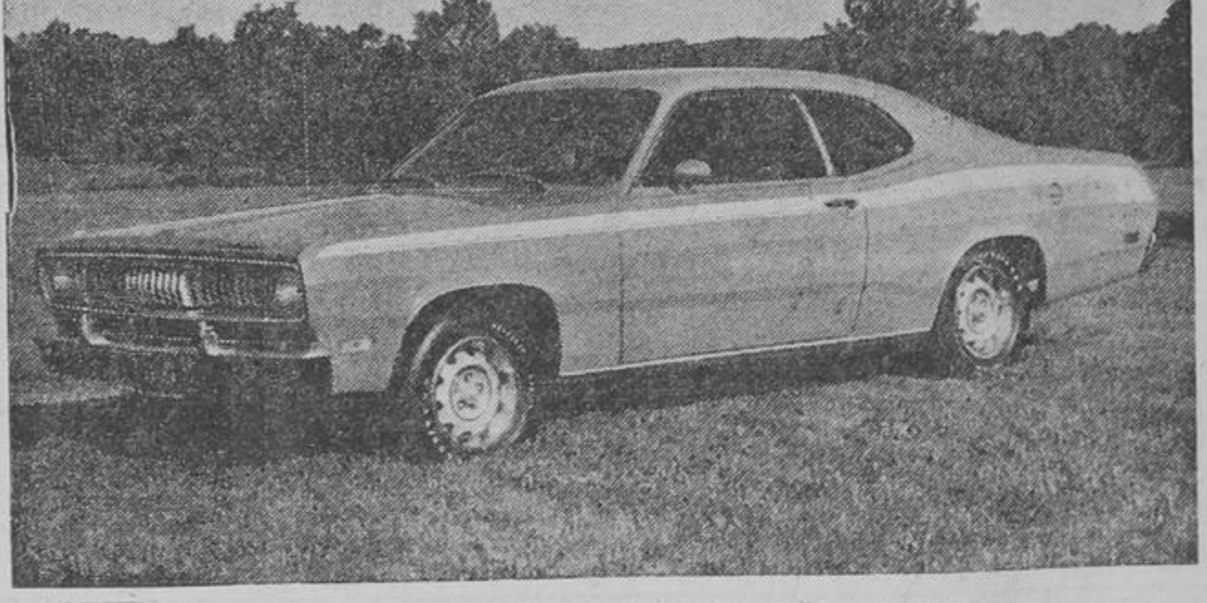
1971 PLYMOUTH SATELLITE 340 SPORT COUPE