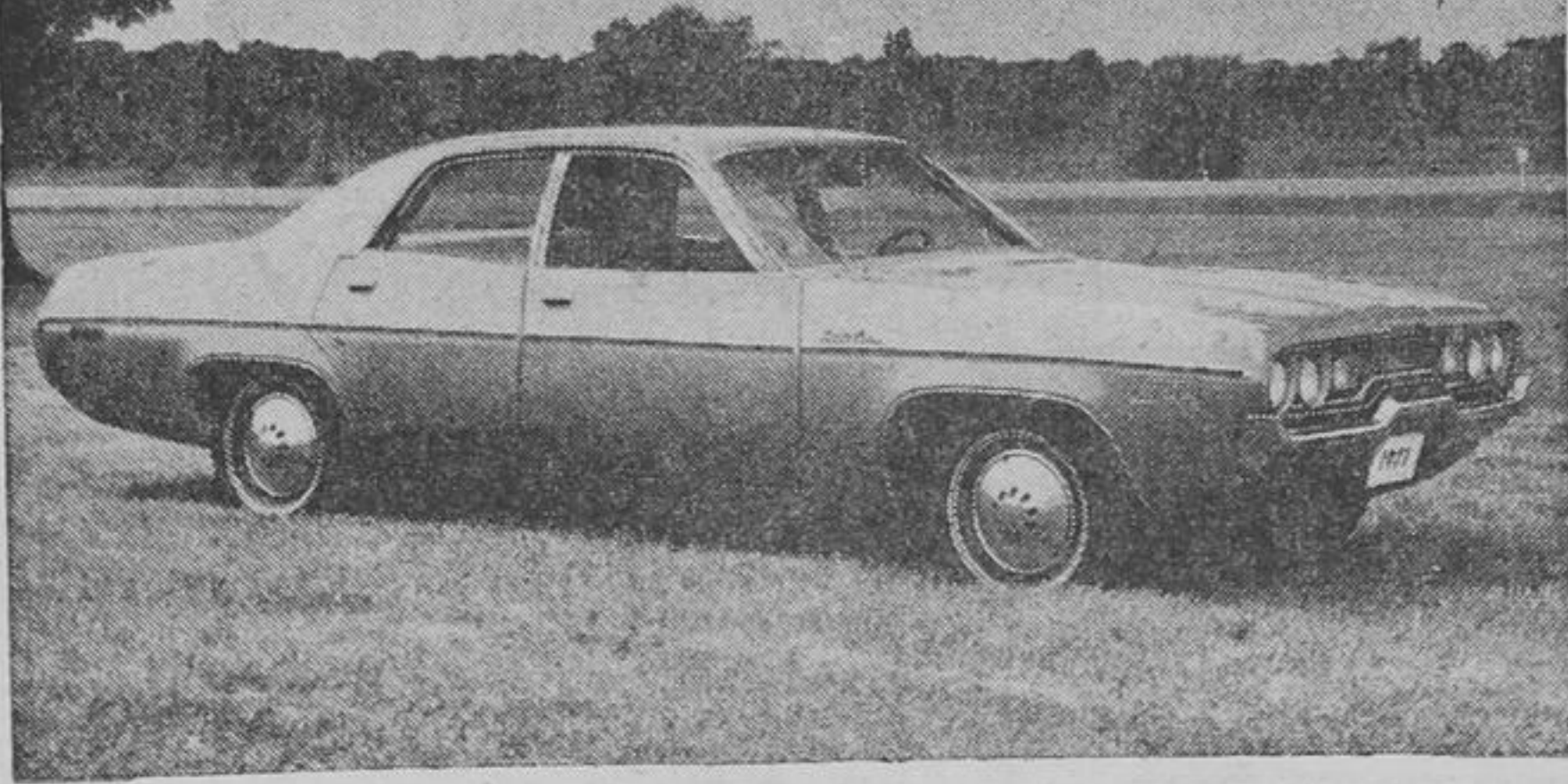
1971 PLYMOUTH SATELLITE CUSTOM FOUR DOOR SEDAN