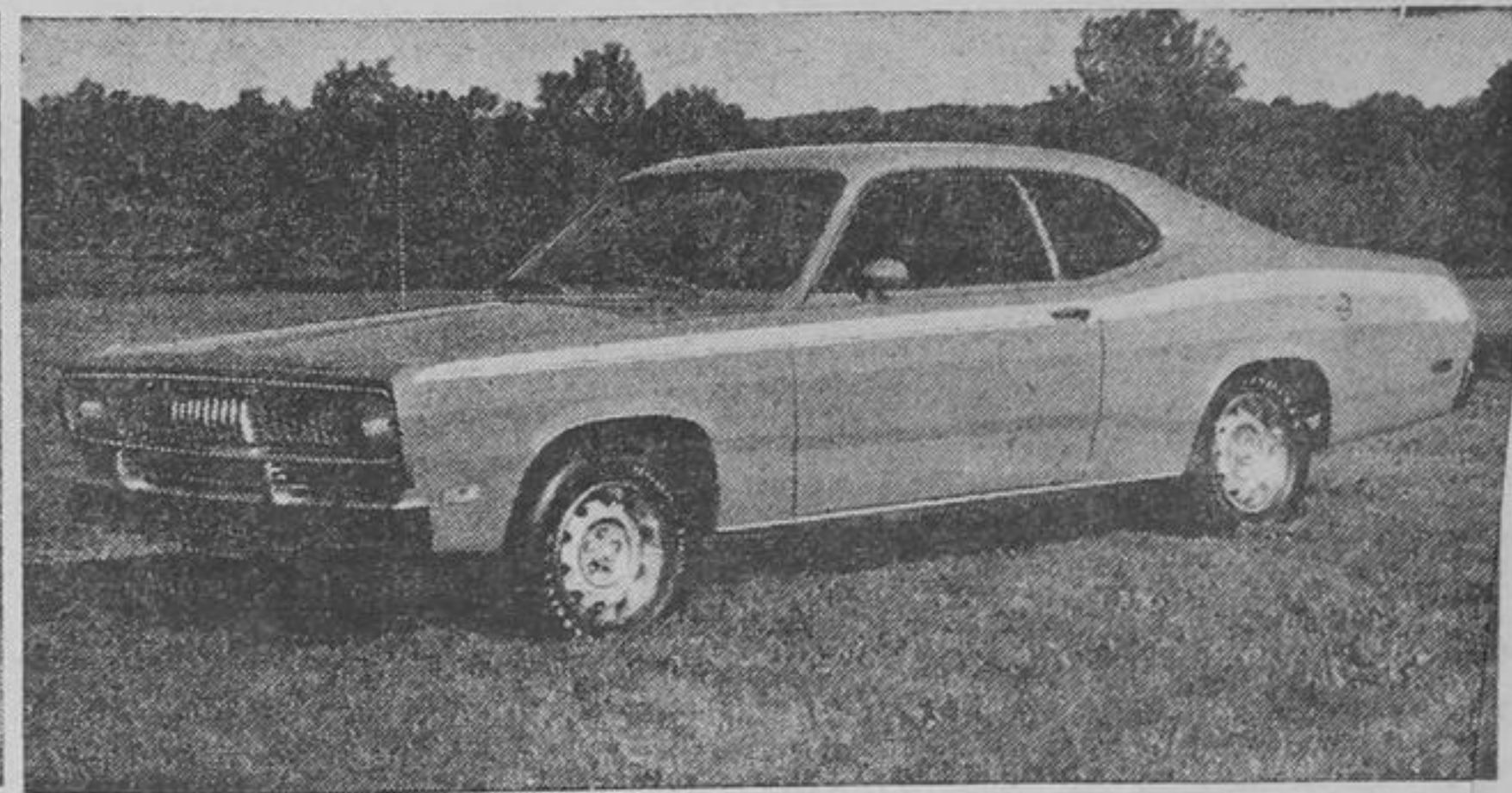
1971 PLYMOUTH DUSTER 340 SPORT COUPE