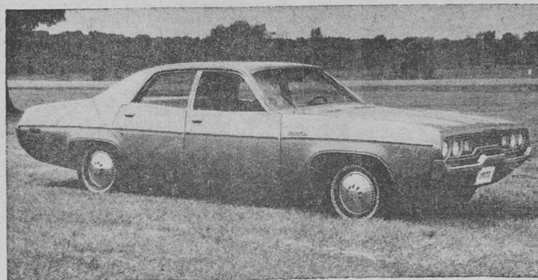
1971 PLYMOUTH SATELLITE CUSTOM FOUR DOOR SEDAN

COME AND SEE THE 1971 CHRYSLER, PLYMOUTH DUSTER AND SATELLITE NOW ON DISPLAY IN OUR SHOWROOM