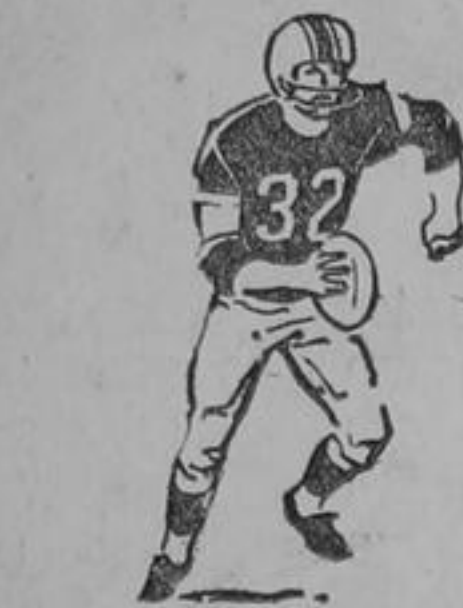
About the Training Camps The new ruling concerning long hair is receiving a severe testing.