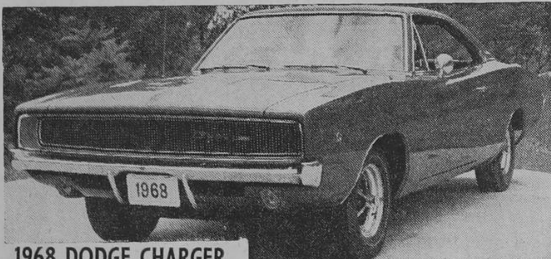
1968 DODGE CHARGER

Tompkins Chrysler Dodge are proud of the new 1968 hot performance cars from Chrysler Corp. The all new Charger and Charger R/T plus the Dart GTS join the ranks of the