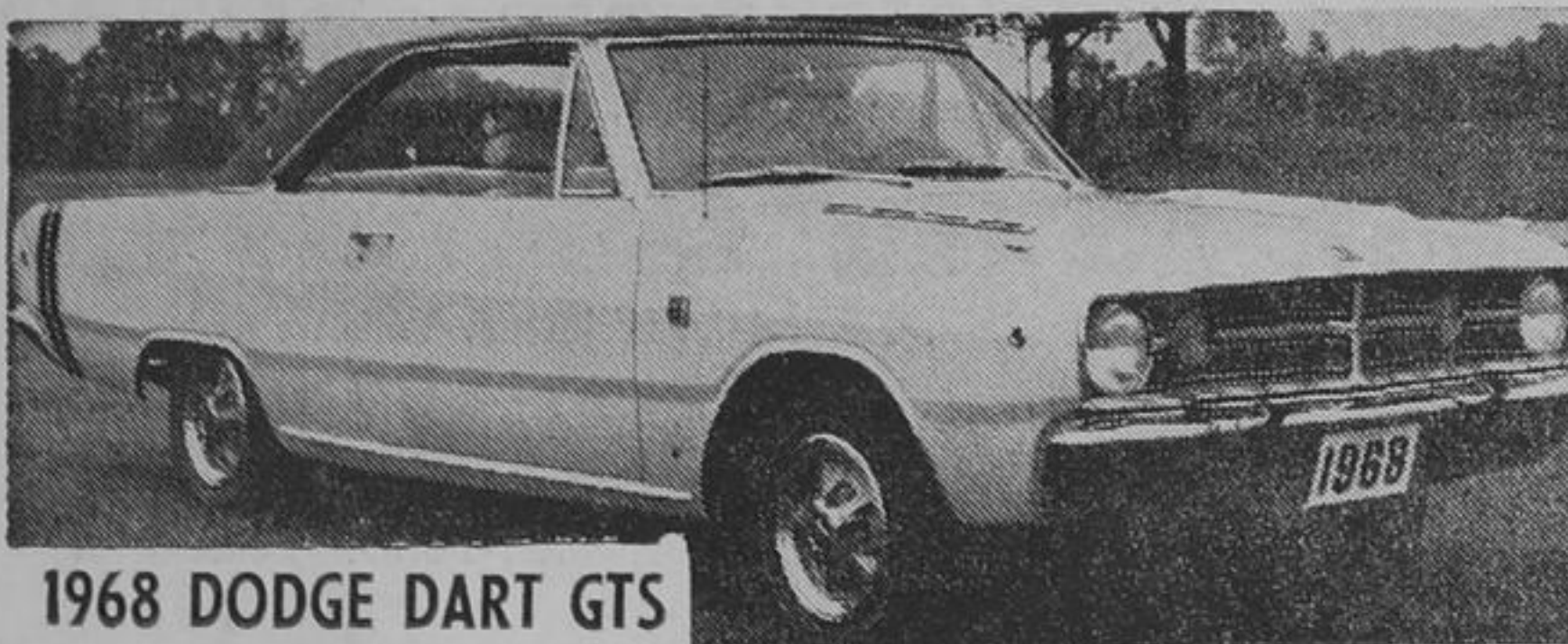
1968 DODGE DART GTS