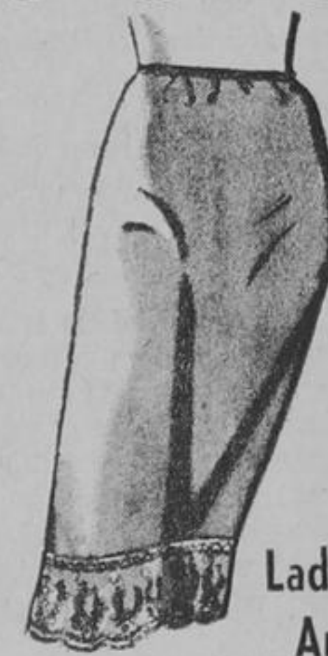
Ladies' Arnel HALF SLIPS

Perky half slippers to keep you feeling feminine. Elastic waist, shadow panel and lace trim around bottom. Sizes S-M-L in shades of White, Pink, Blue, Aqua, Nude, Red and Black.