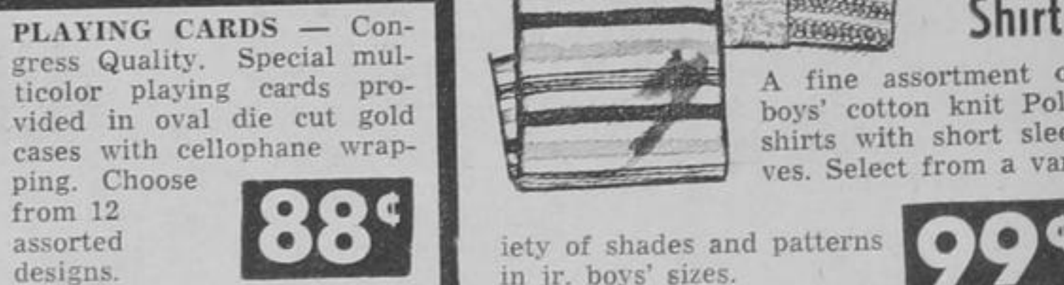
Boys' Knit Polo Shirts

A fine assortment of boys' cotton knit Polo shirts with short sleeves. Select from a variety of shades and patterns in jr. boys' sizes.