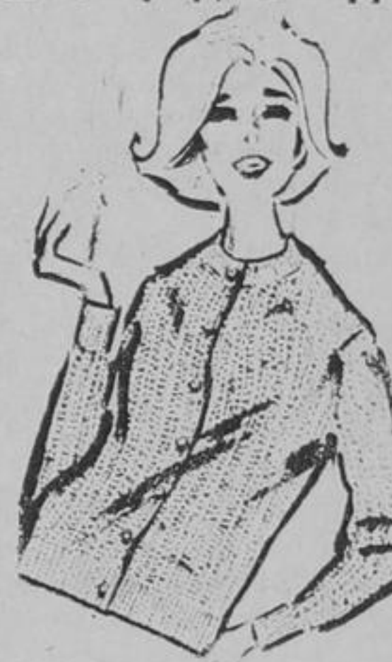
Ladies' Bulky Orlon Cardigans

White and assorted shades in this warm and pretty bulky orlon cardigan. First quality sweaters, sizes S-M-L.