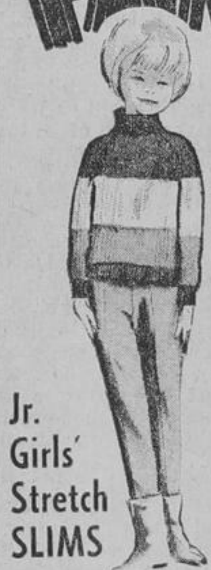
Jr. Girls' Stretch SLIMS

Stretchy slims for the junior Miss. Wide variety of attractive shades and jr. girls' sizes. Trim fitting, comfortable and warm.