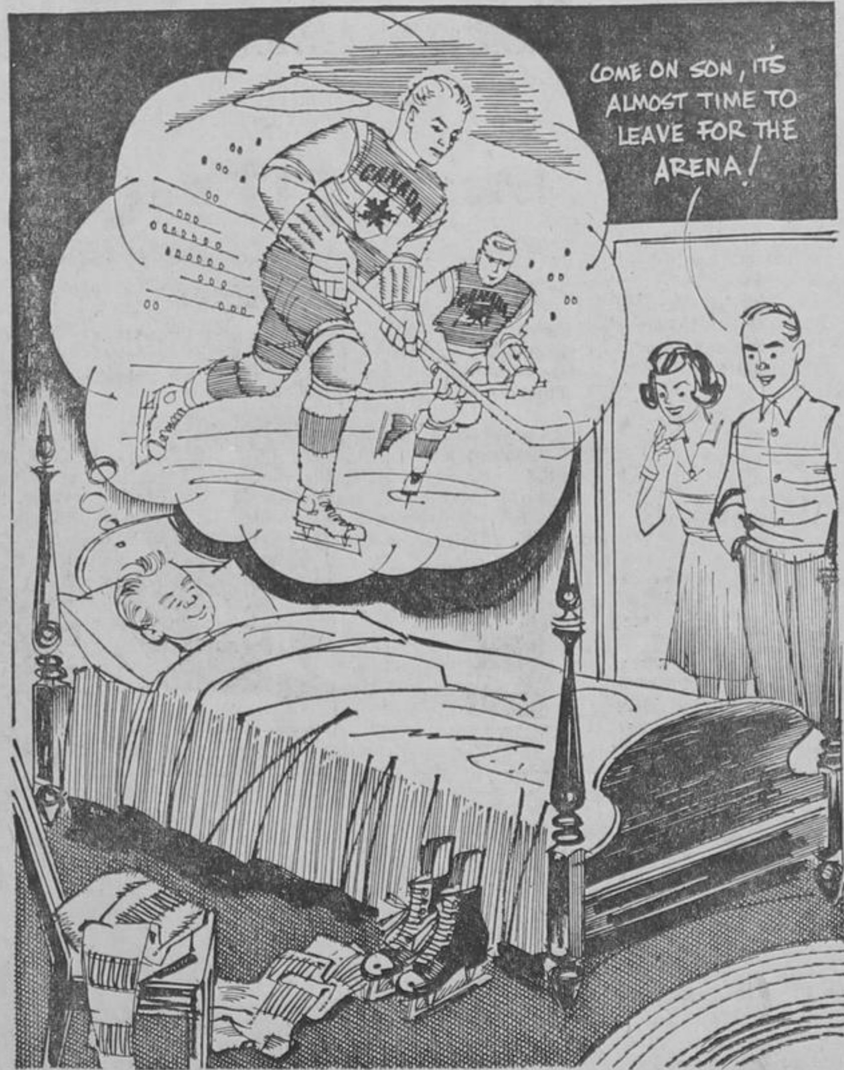
MINOR HOCKEY WEEK STARTS SATURDAY, JANUARY 22