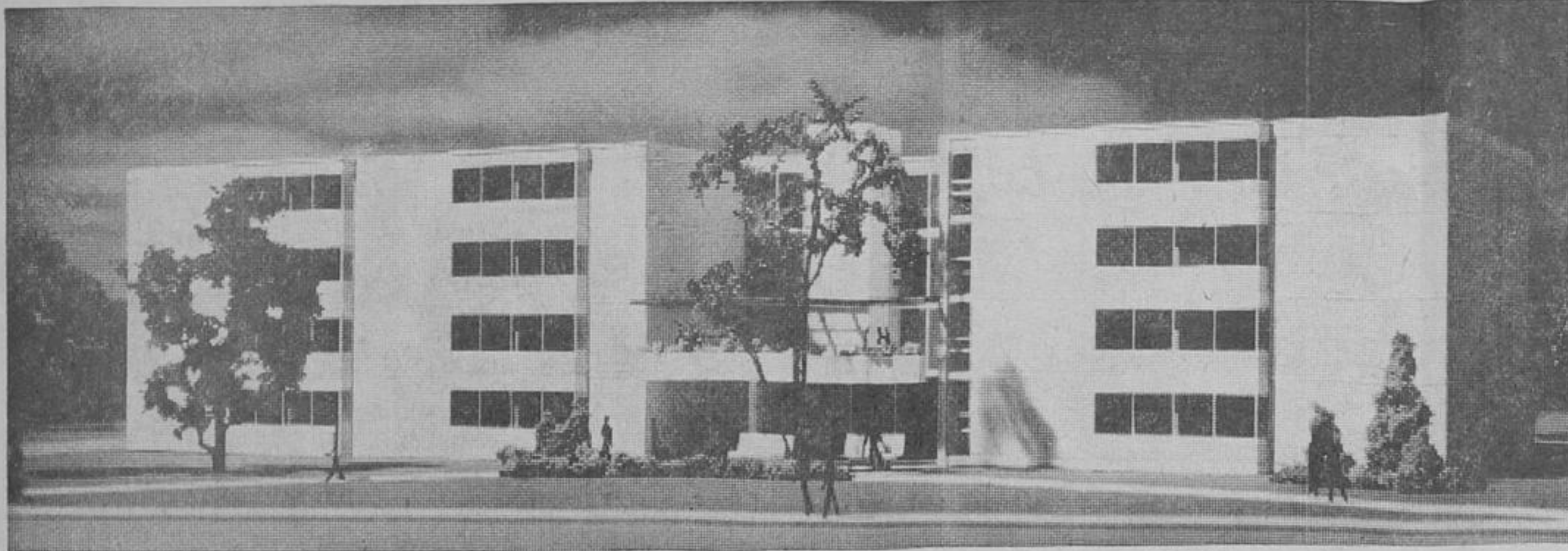
56-SUITE BUILDING TO BE ERECTED ON DUFFERIN STREET