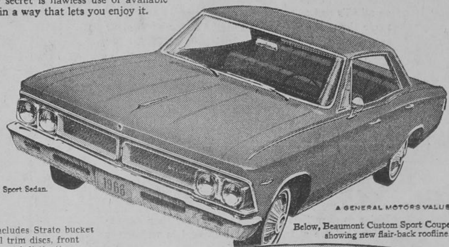
Beaumont Custom Sport Sedan.

Right Price! Look at Beaumont. Take a long look. All this luxury, eye-stopping style, and the performance to go with it, is priced remarkably low. A 120 hp six or 195 hp V8 is standard, or select a more powerful six or one of two V8s (up to 360 hp with Sports Option*). Transmissions to match. With Beaumont, everything matches.