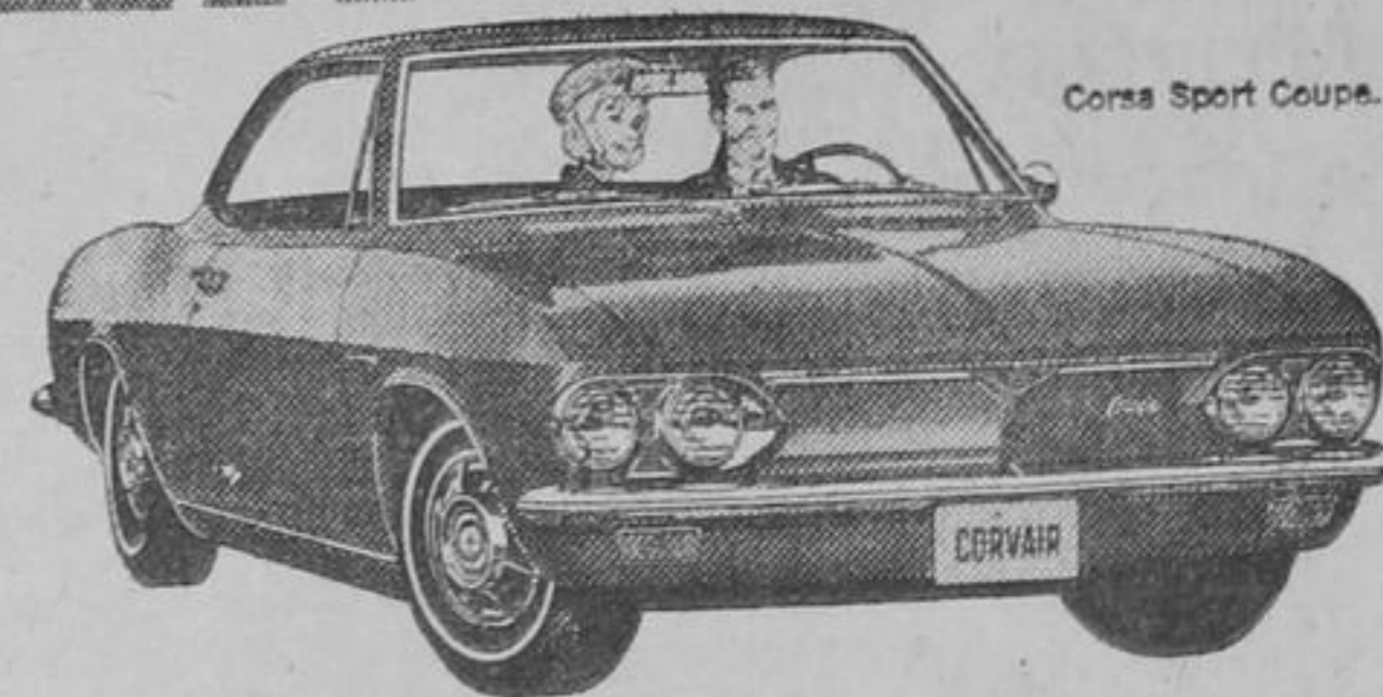
Corsair Sport Coupe.

Corvaire, like all the '66 Chevrolets, has a padded instrument panel, padded sun visors. Seat belts front and rear. Backup lights, windshield washer and 2-Speed wipers, outside rear-view mirror. Fully synchronized 3-Speed transmission. All of it standard equipment. Corsas. Monzas. 500's. Come get one. Stay young.