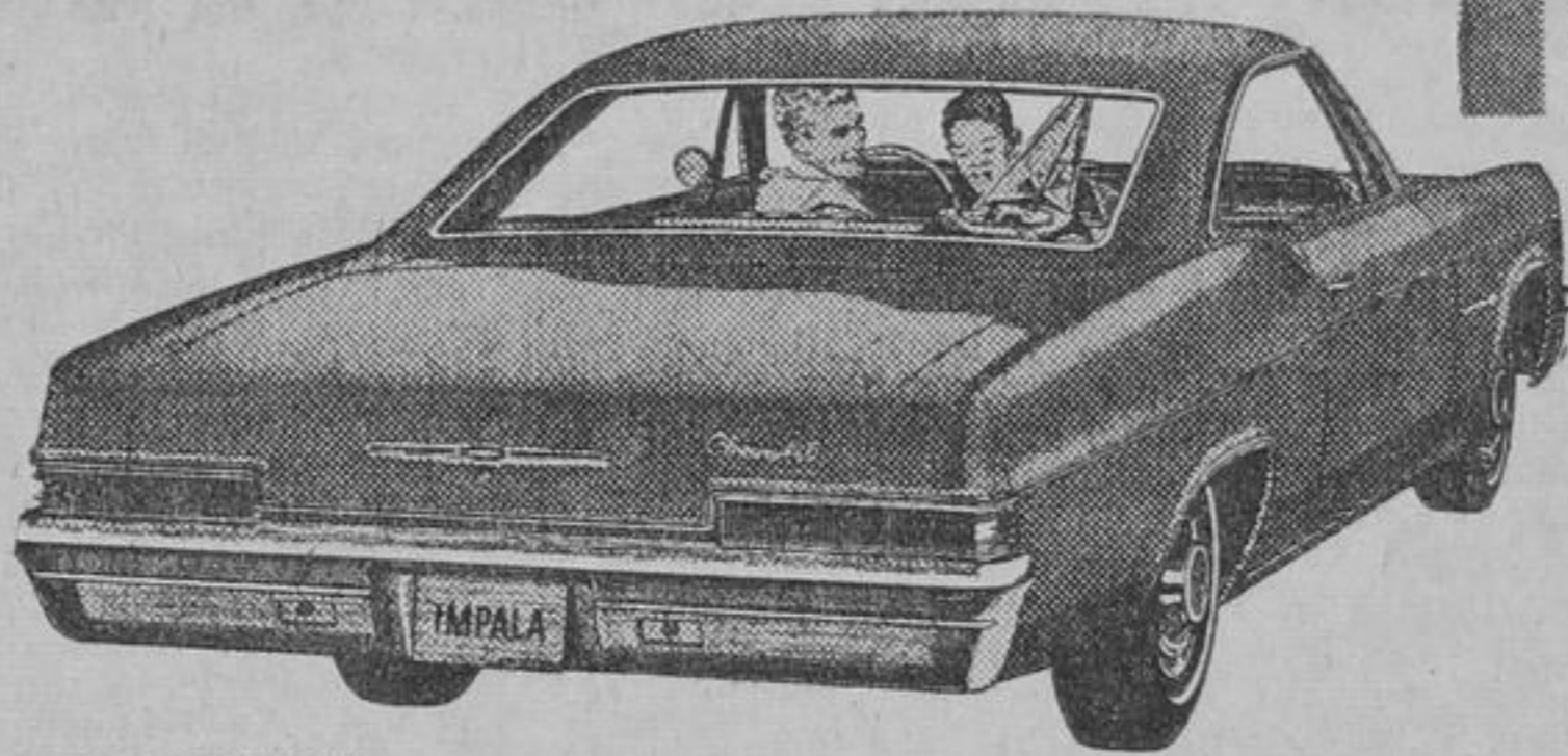
Impala Sport Coupe.

No Chevrolet has ever had a ride like this one. It's smooth, solid, quiet. You can specify a Turbo-Jet "396" engine at 325-hp. Smooth, quiet, plenty of reserve power (Just one of six engines available up to a 425-hp Turbo-Jet "427" V8). But really, there's only one way to find out all that's great about the '66 Chevrolet with its beautiful new Body by Fisher. Ride in one.