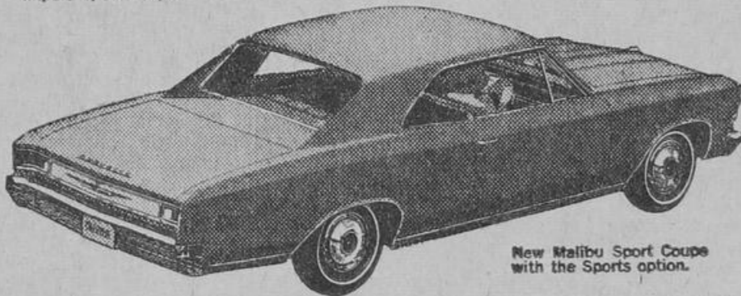
New Malibu Sport Coupe with the Sports option.

New sculptured rear deck, dramatic new rooflines, broad new grille design, powerful new engine range, and Chevrolet's kind of quality are what set '66 Chevelle apart from the pack. But the only way to appreciate a '66 Chevelle is to see it for real. And you can't do that here. The place to go is your Chevrolet dealer's.