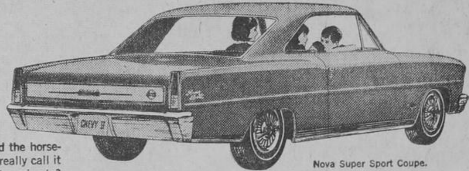
Nova Super Sport Coupe.

Chevy II is something else again for 1966. We've lowered the roof, raised the horsepower available and given it a whole new look. It's so different, we should really call it the Chevy III. What's the economical dependable, salt-of-the-earth Chevy II coming to? A lot of very smart car buyers, the way we figure it.