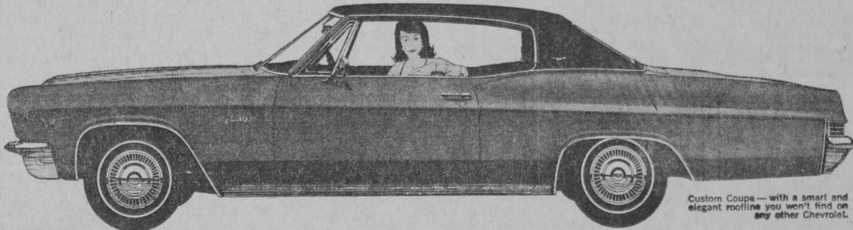
Custom Coupe — with a smart and elegant roofline you won't find on any other Chevrolet.

A whole new series of elegant new models — the most lavish Chevrolet has ever built. There's the Caprice Custom Coupe, Caprice Custom Sedan and the luxurious new Caprice Custom Wagon. Truly elegant in every detail, they invite (and deserve) your closest inspection.