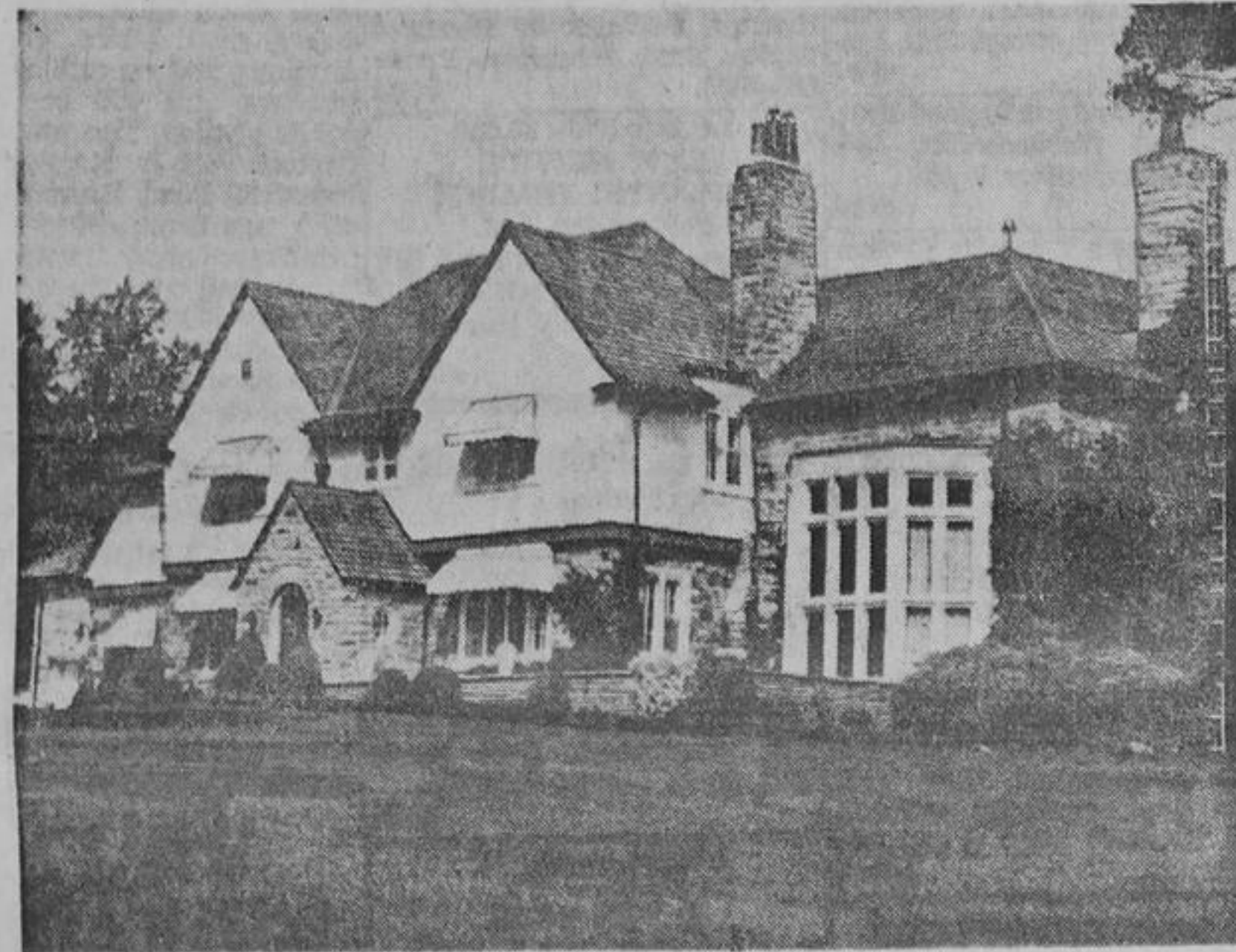
This house is at the south-west corner of Bayview and Steeles.