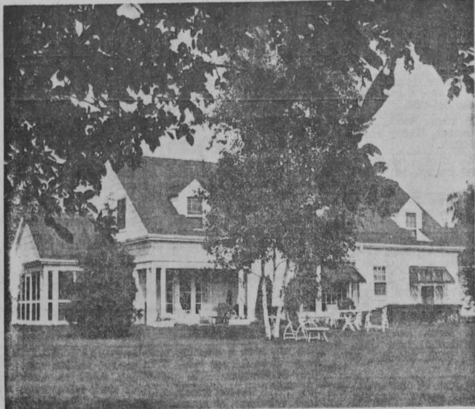
This is the backyard of a home at the south-east corner of Bayview and Steeles.

RICHMOND HILL 15 Yonge Street North—Telephone 884-4431 (over the Bank of Montreal) Ask about our evening hours