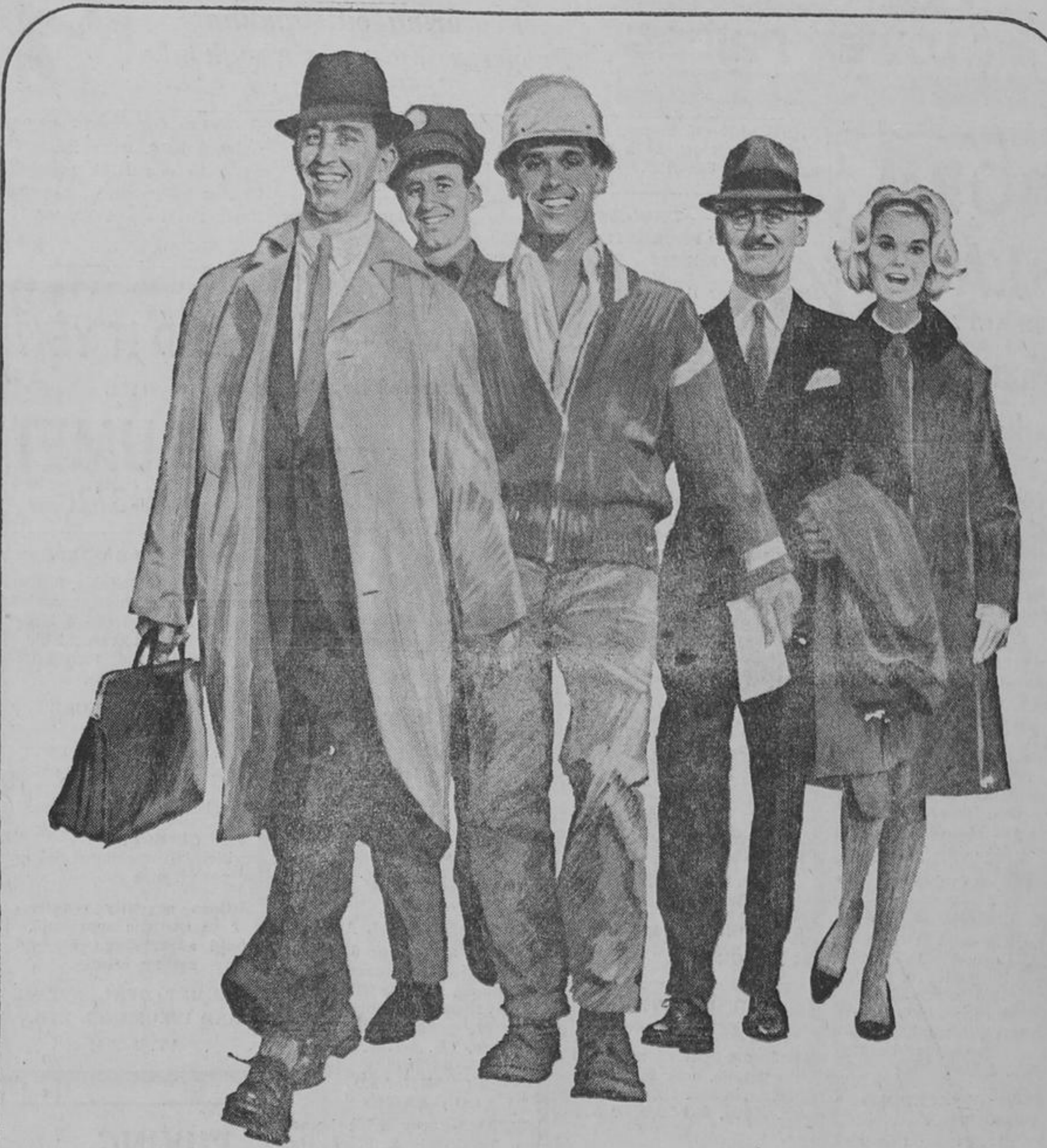
We owed them a lot in 1964