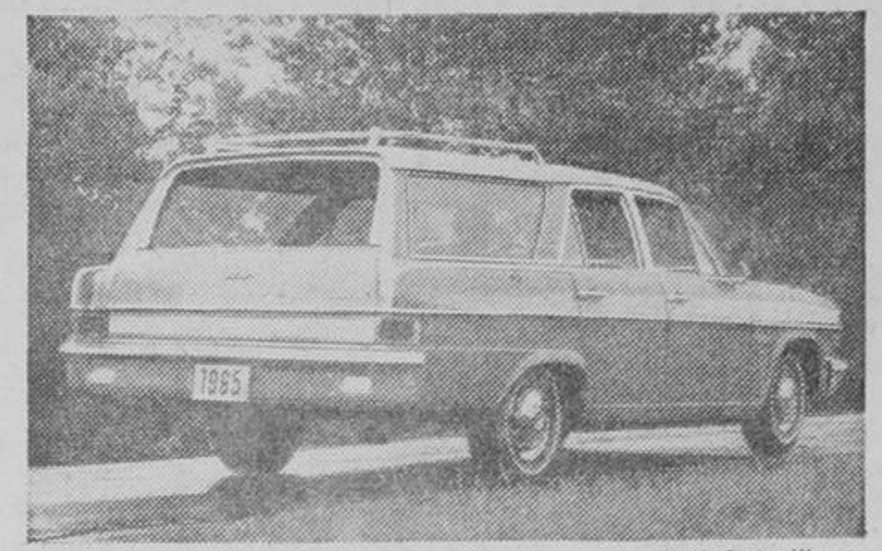
Classic Station Wagon

Great new engine choice! Get Torque Command, the bold new six that acts like an eight. Available in 145-155 h.p., single or 2-barrel carburetor or 128 h.p. Or go V8! Get the Classic 198 h.p. V8 with new improved 2-barrel carburetor. Quick-moving action teamed with regular-grade fuel savings. Put your foot on the fast new Rambler Classic's accelerator. Take a test drive today!