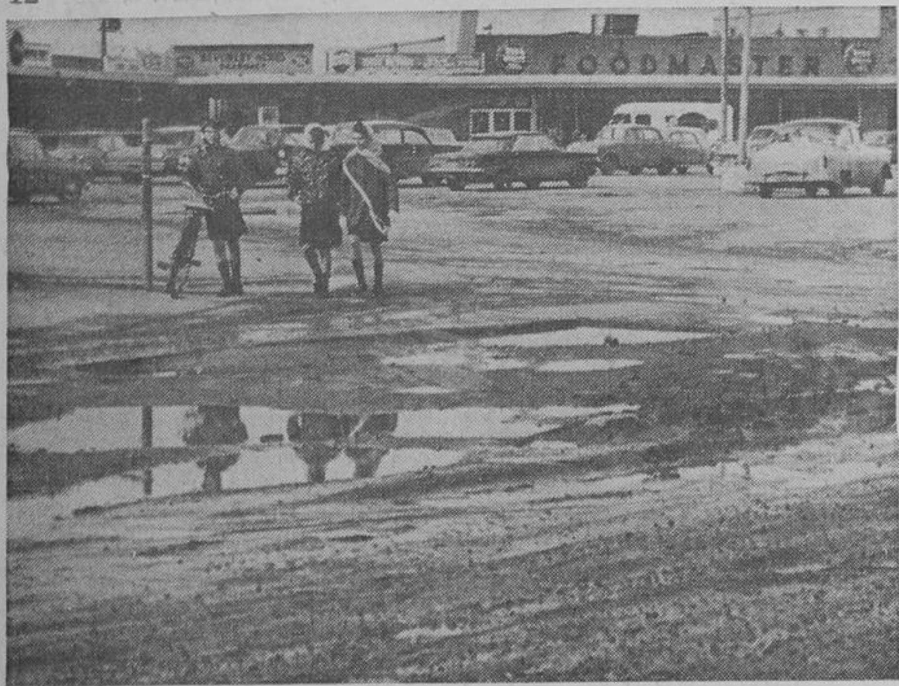
POTHoles GONE FROM BAYVIEW PLAZA ENTRANCE