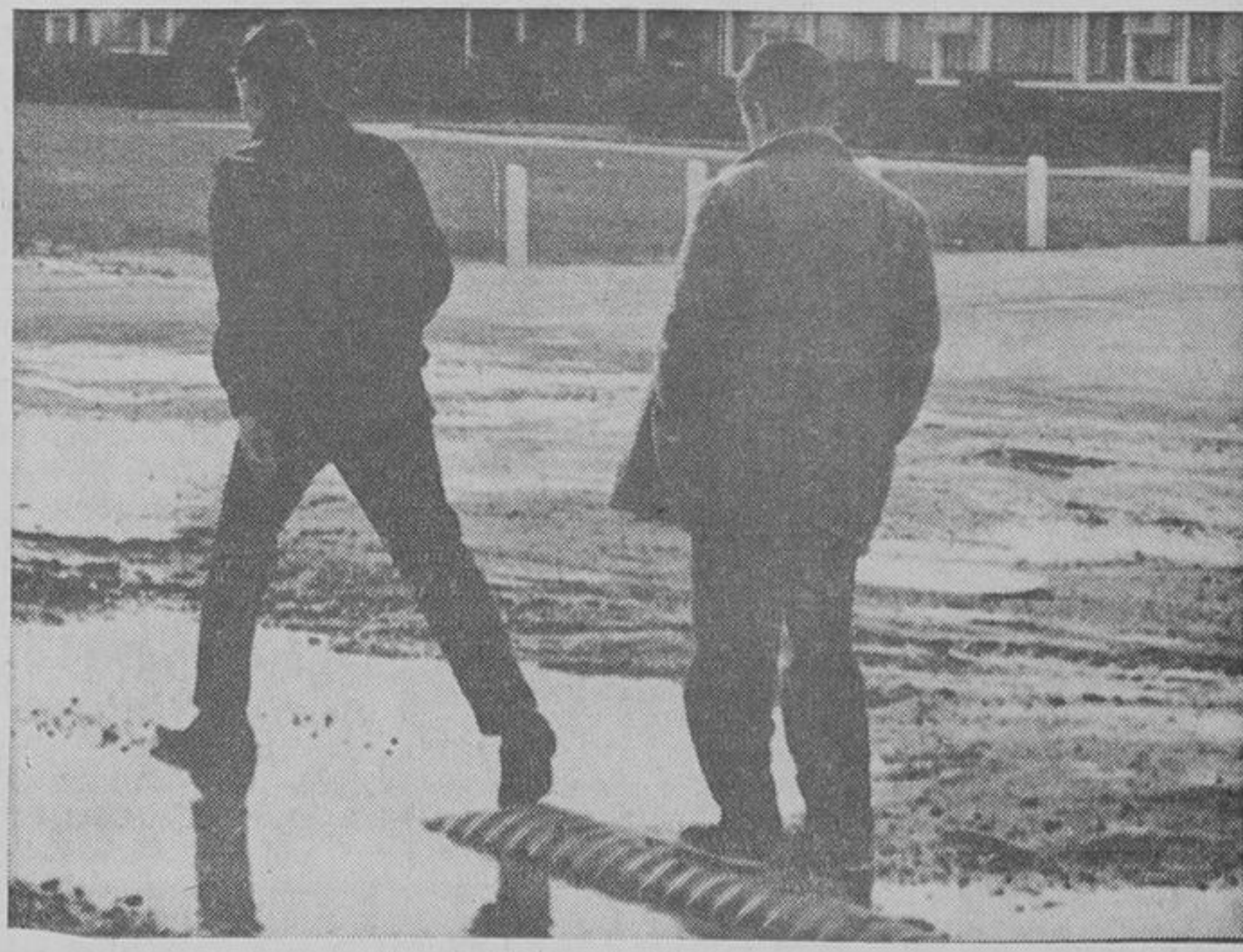
NO MORE WADING TO SCHOOL . . . NEW SIDEWALK