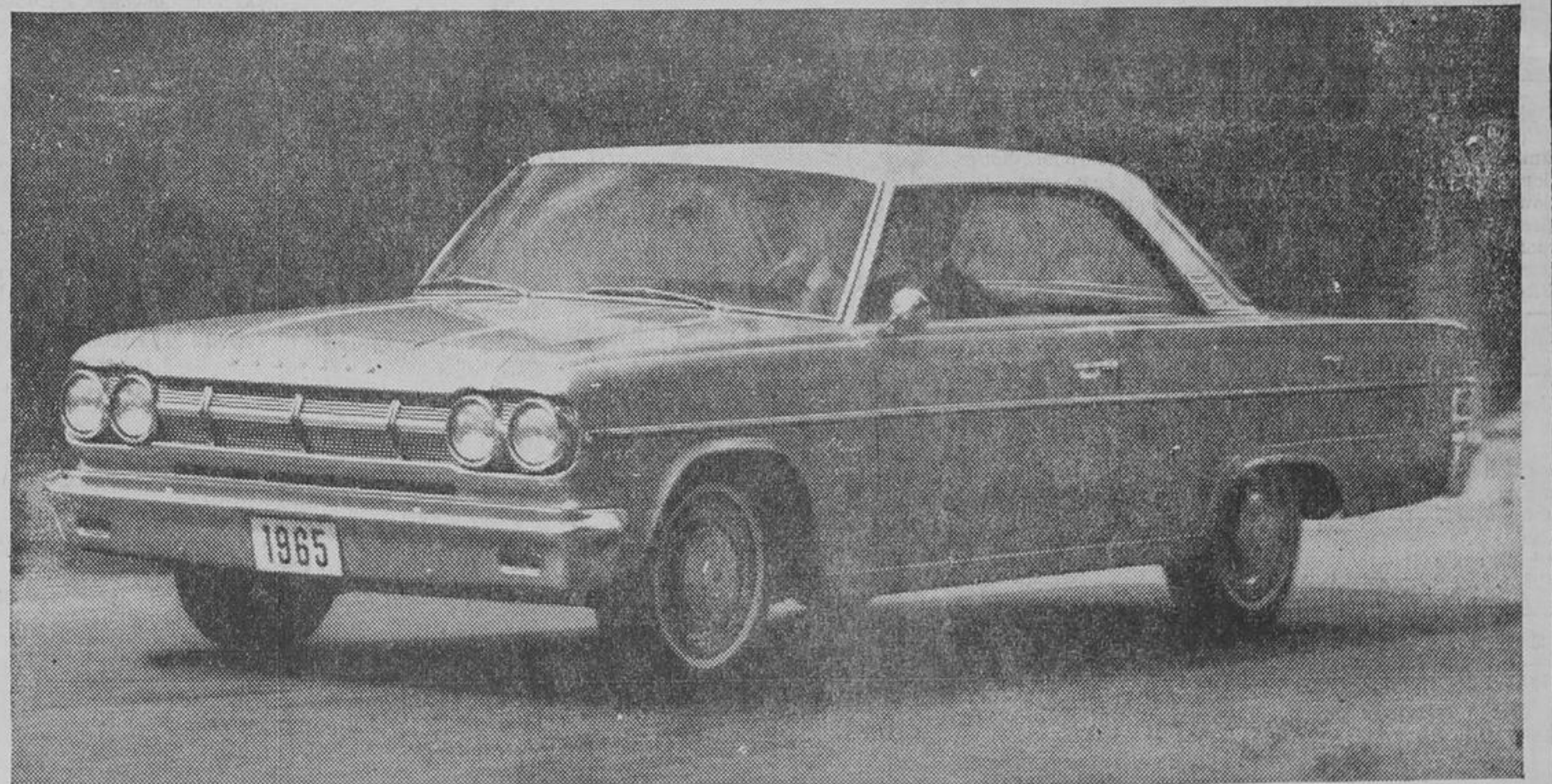
CLASSIC 2 DOOR HARDTOP

the '65 Classic. You'll find more people space, thanks to re-designed interiors. There's more foot-room, leg-room, elbow-room—and much more luggage space. ■ Interiors and appointments are the best-looking, handsomest you'll find. Style and luxury are standard equipment. ■ You get exclusive Rambler quality features: strong, safe, rattle-free Single Unit Construction with Uniside; Deep-Dip Rustproofing; Ceramic-Armoured Muffler; Double Safety Brakes. ■ With great new 6 and V8 performance, plus more people space and more luggage space, and a wide new range of power options and features, the Rambler Classic is more than ever Canada's best car value in every model—sedans, wagons, hardtops. Don't miss the day of the fast new Rambler Classic. There's a convincing test drive waiting for you right now at your Rambler Dealer's.