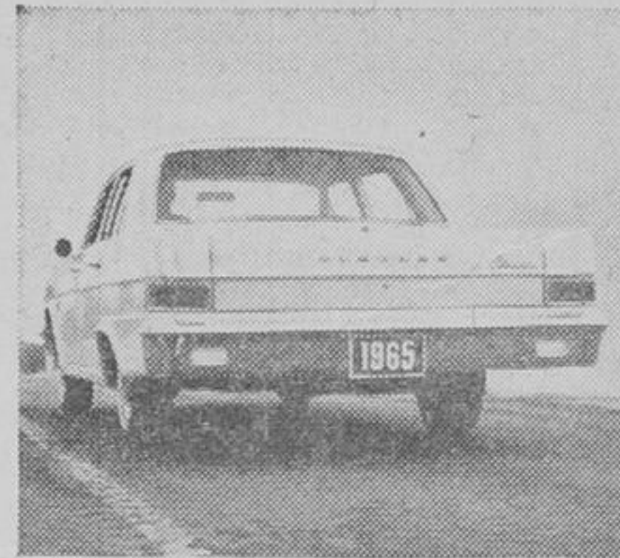
Classic 4-Door Sedan

A PRODUCT OF AMERICAN MOTORS (CANADA) LIMITED