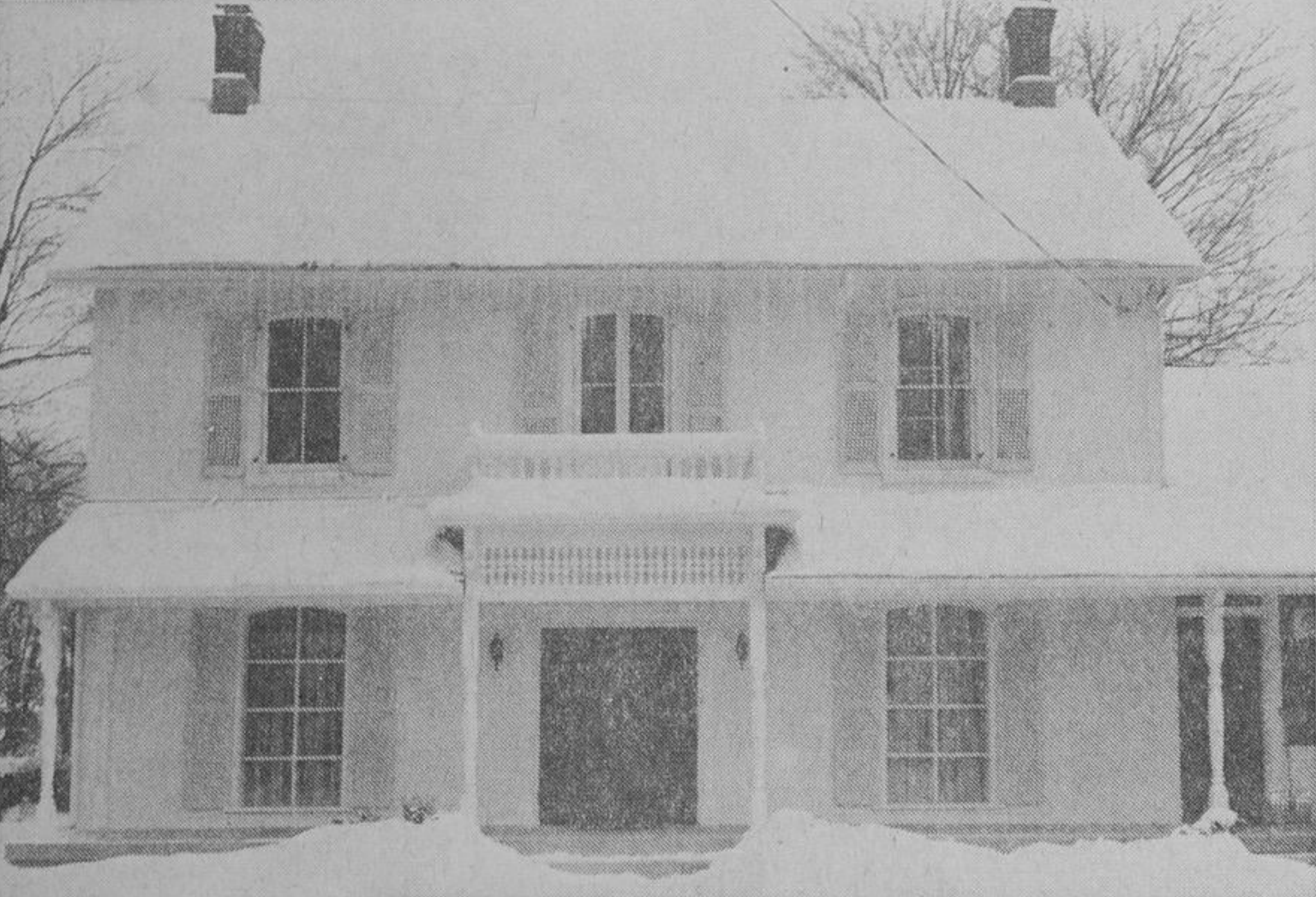
Thornhill Home Of Insurance Head Office