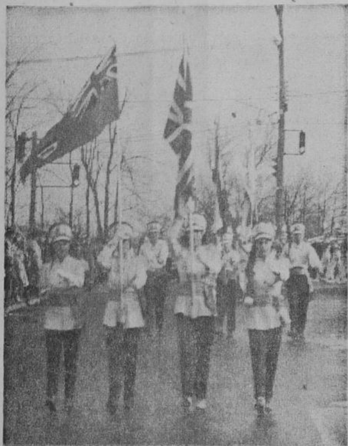
LEASIDE COLOR PARTY