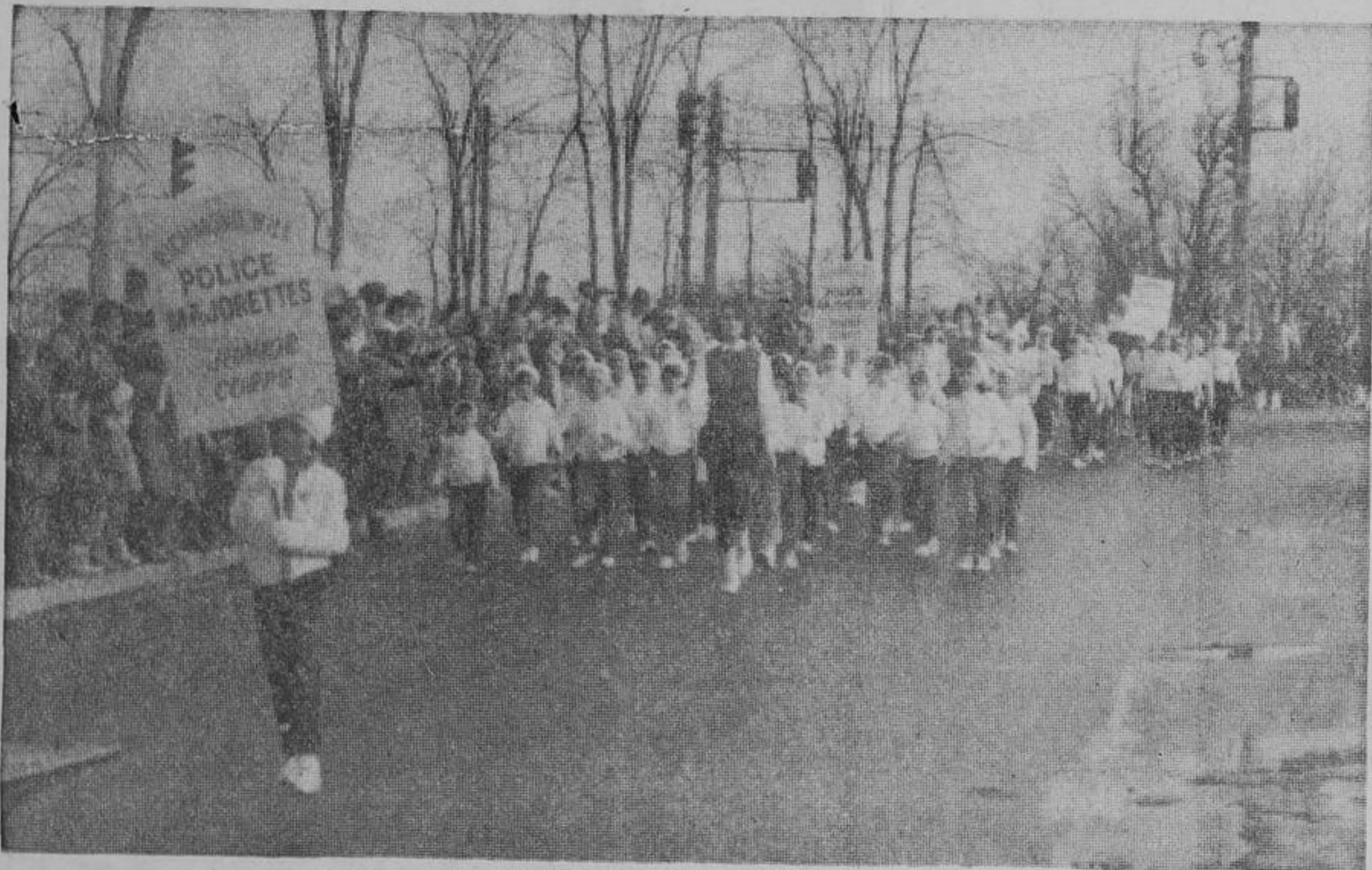
RICHMOND HILL POLICE MAJORETTES JR. CORPS