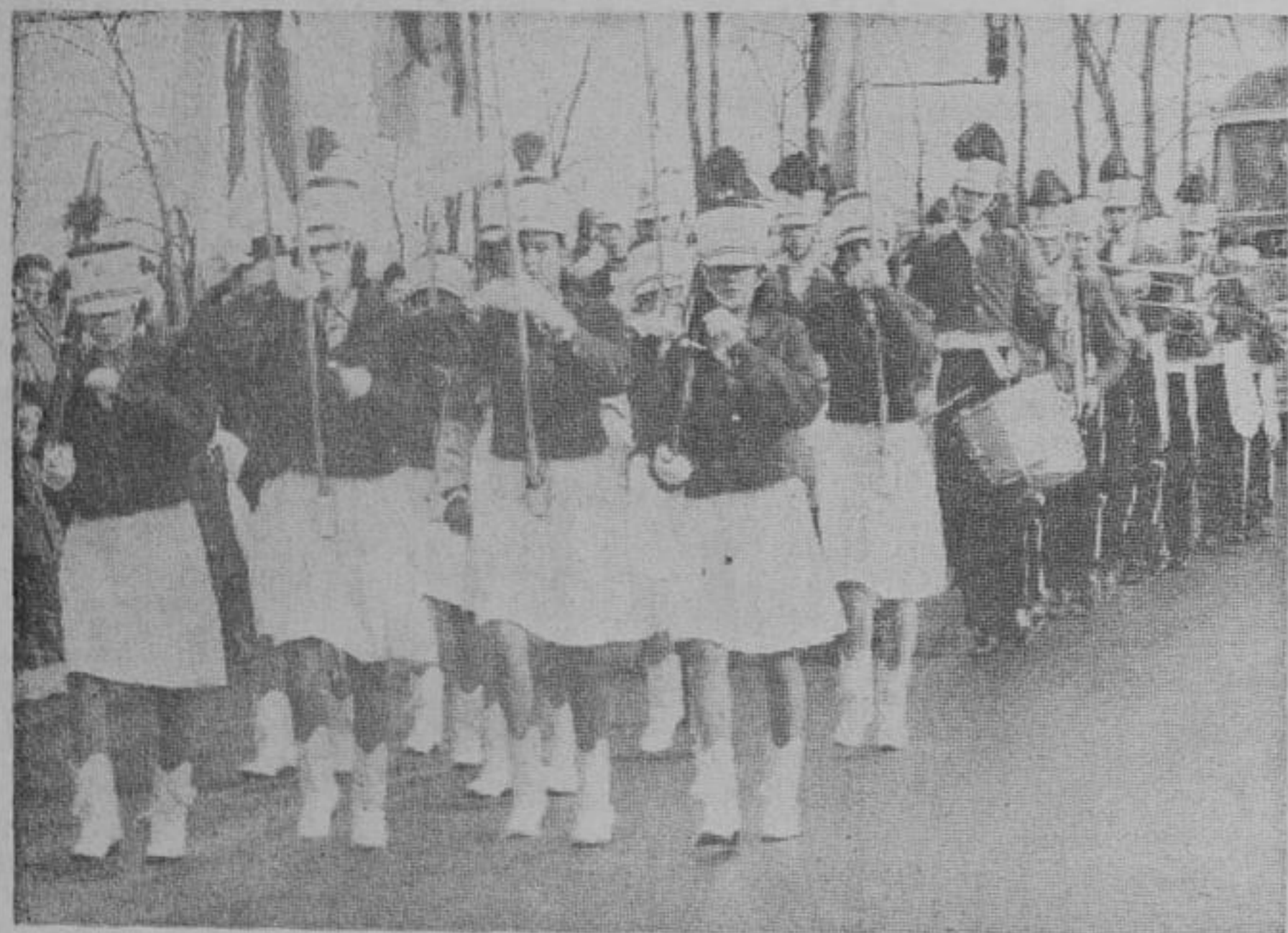
RICHMOND HILL TOPPERS BAND