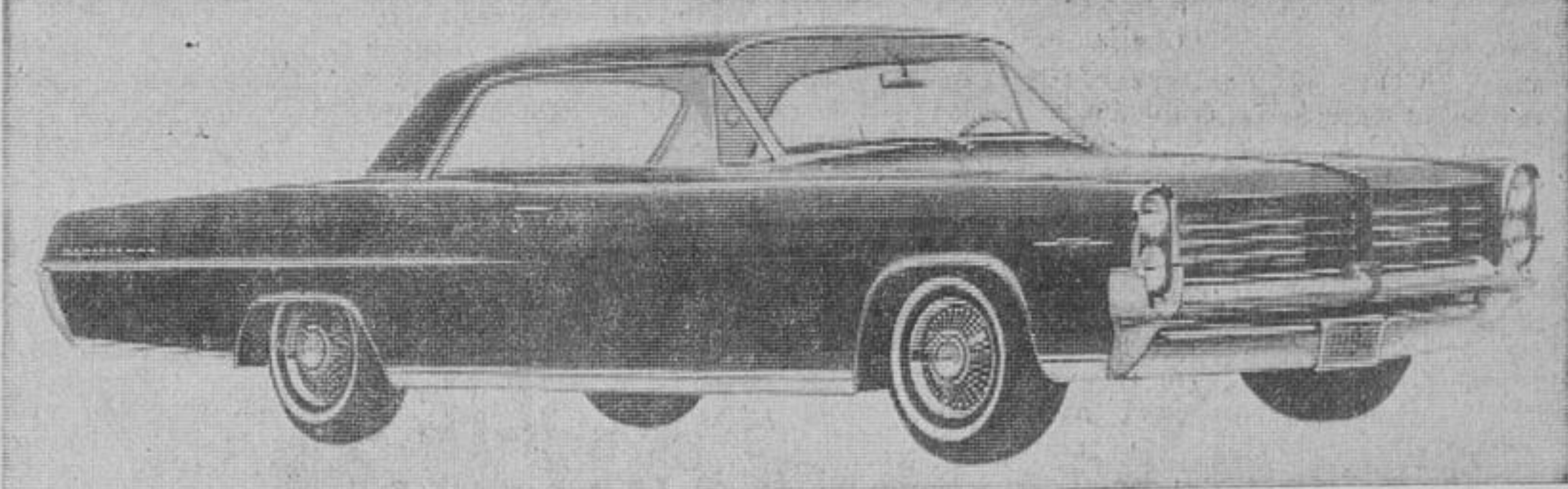
(ABOVE) Acadian Beaumont Custom Sport Coupe (AT RIGHT) Pontiac Parisienne Sport Coupe

We welcome this opportunity to show you the new 1964 models.... worthy in every way of this outstanding line.