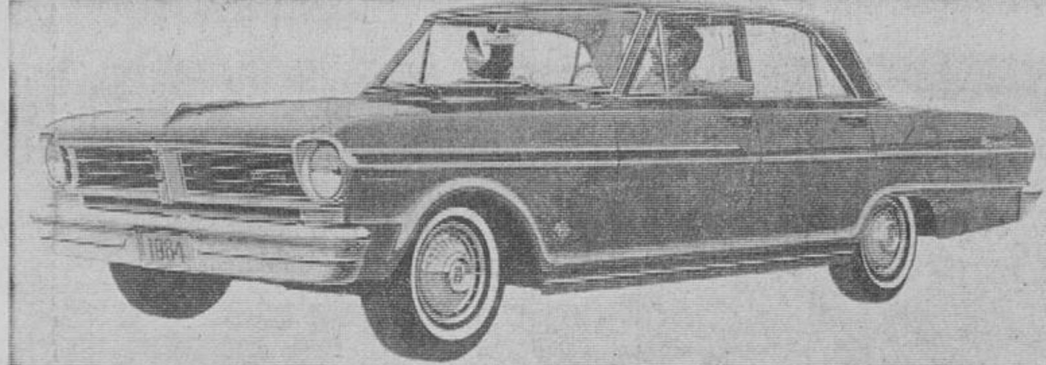
(AT LEFT) Acadian Canso 4 Door Sedan

Come In And Browse Around In Comfort REFRESHMENTS WILL BE SERVED