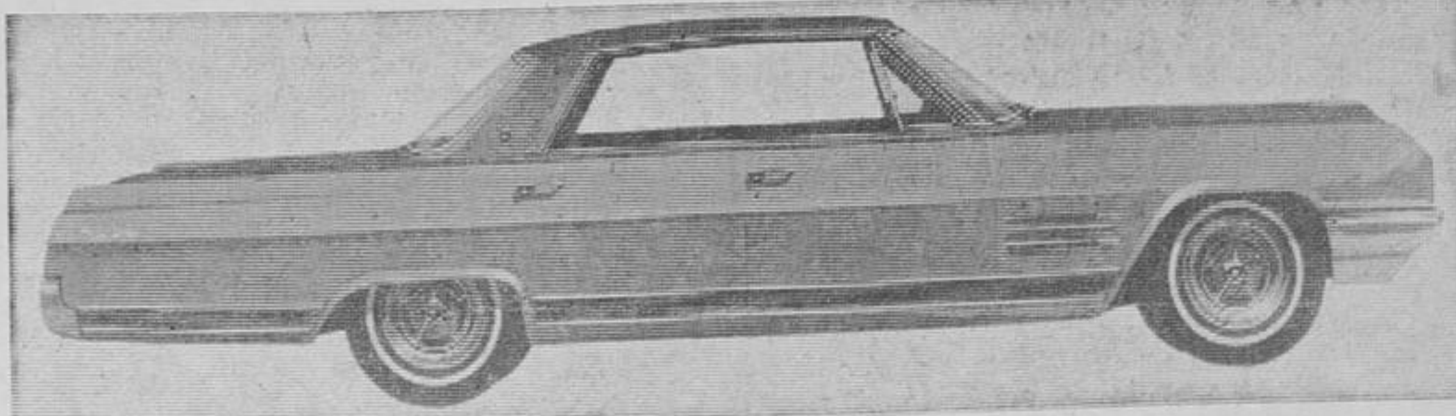
(BELOW) Buick Wildcat 4 Door Hardtop

Come In And Browse Around In Comfort REFRESHMENTS WILL BE SERVED