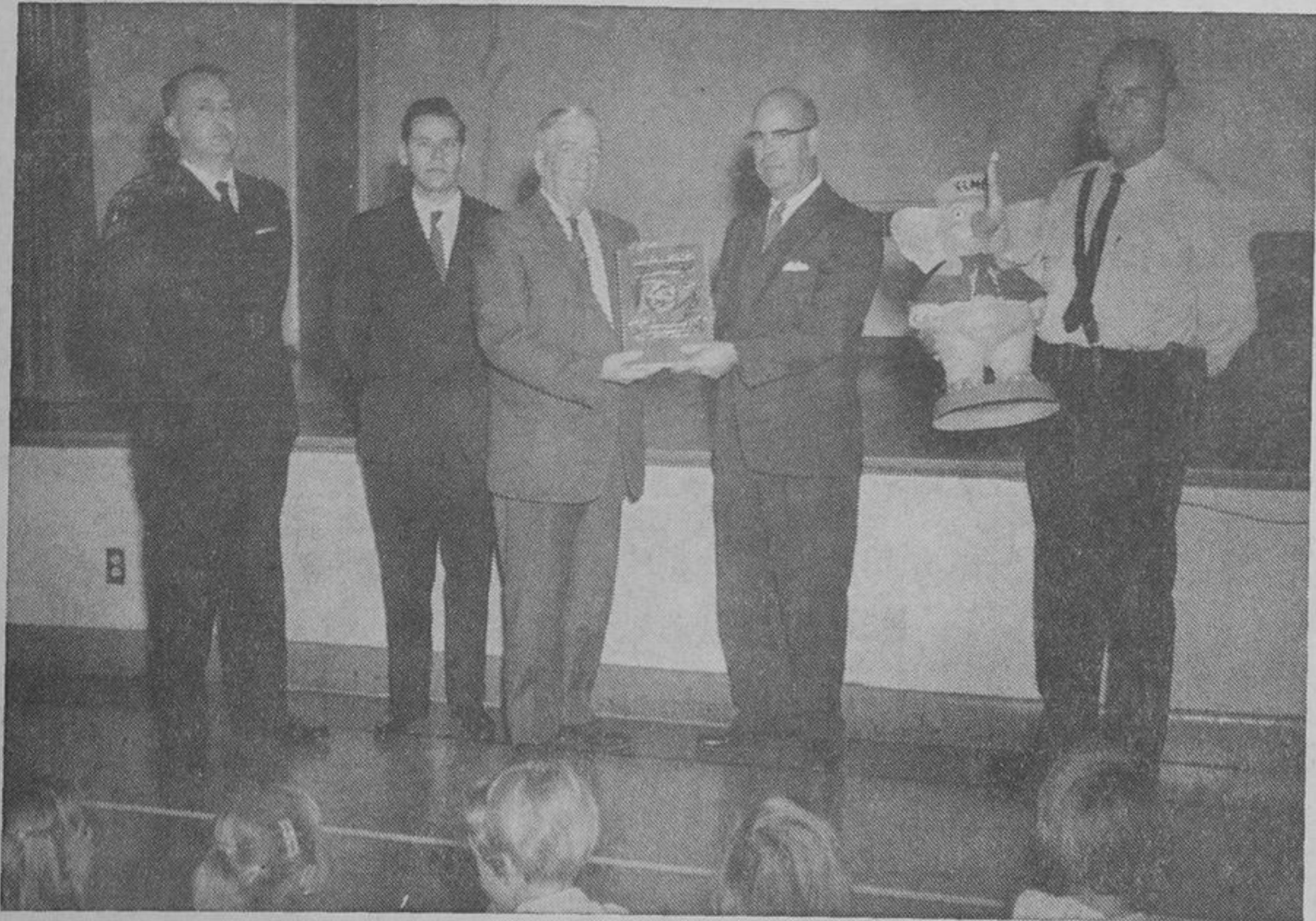
McConaghy School Receives Safety Award