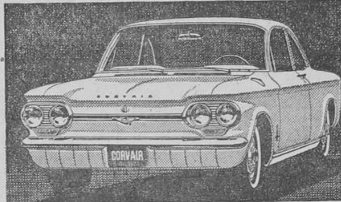
'64 Corvair Monza Club Coupe.

Major suspension refinements make Corvette ride more smoothly. New transmissions go with the four big V8s.