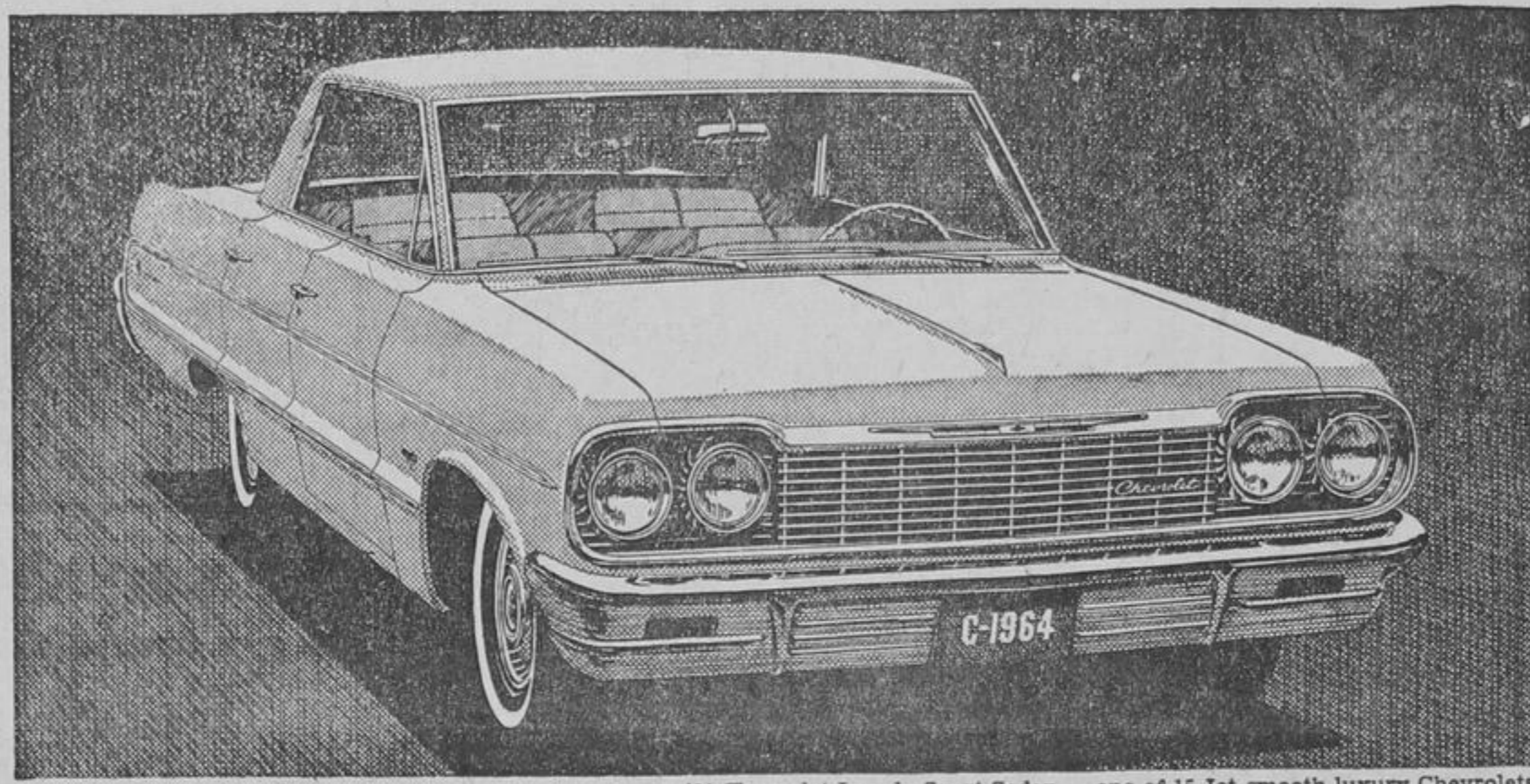
'64 Chevrolet Impala Sport Sedan — one of 15 Jet-smooth luxury Chevrolets.

Big luxury, big style, big room in the most luxurious CHEVROLET ever!