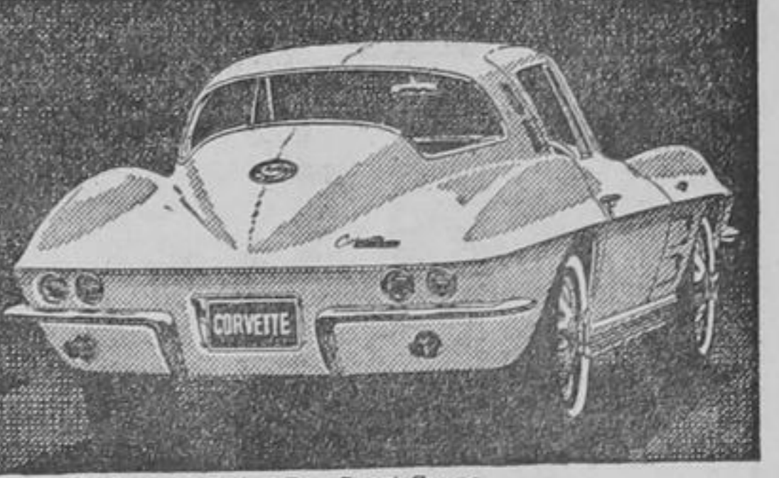
'64 Corvette Sting Ray Sport Coupe.

See five entirely different lines of cars at your Chevrolet dealer's