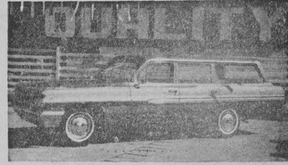
1962 PONTIAC RANCH WAGON

An almost new ranch wagon in immaculate condition, Royal blue finish with matching interior, Custom G.M. options include V8 engine and custom radio.