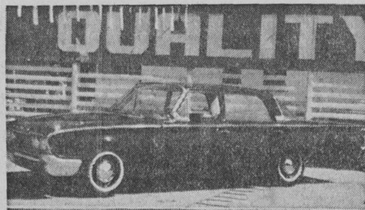
1960 FORD FAIRLANE SEDAN

LOOK AT THE SMALL DIFFERENCE YOU PAY FOR A GUARANTEED QUALITY USED CAR