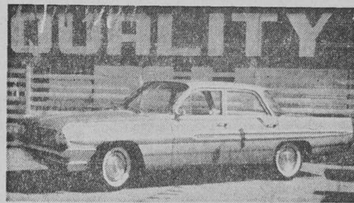
1961 PONTIAC FORDOR