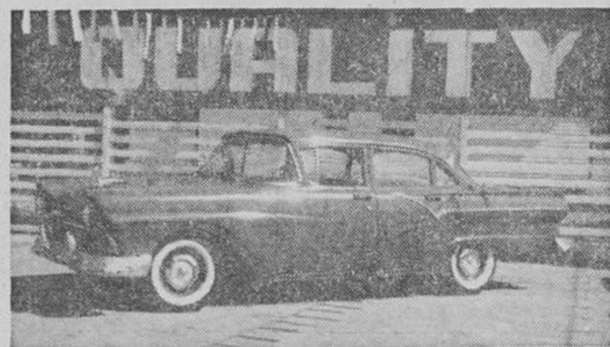
1957 FORD FORDOR