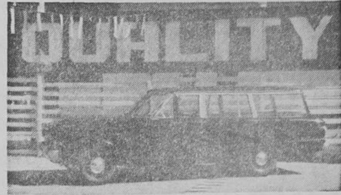
1960 FALCON TUDOR RANCHWAGON