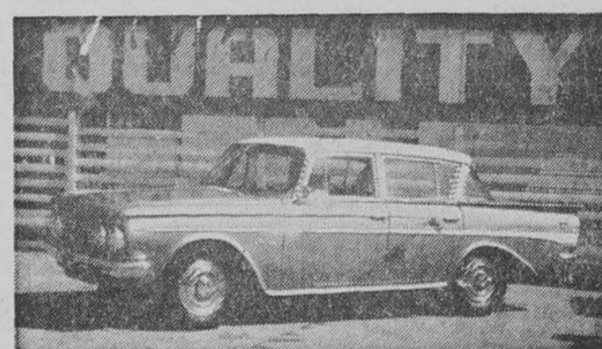
1961 RAMBLER FORDOR SEDAN

LOOK AT THE SMALL DIFFERENCE YOU PAY FOR A GUARANTEED QUALITY USED CAR