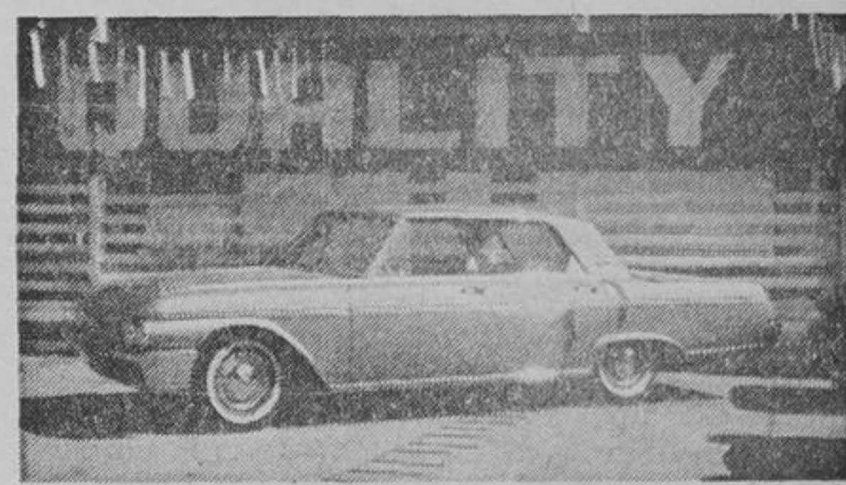
1962 GALAXIE FORDOR HARDTOP