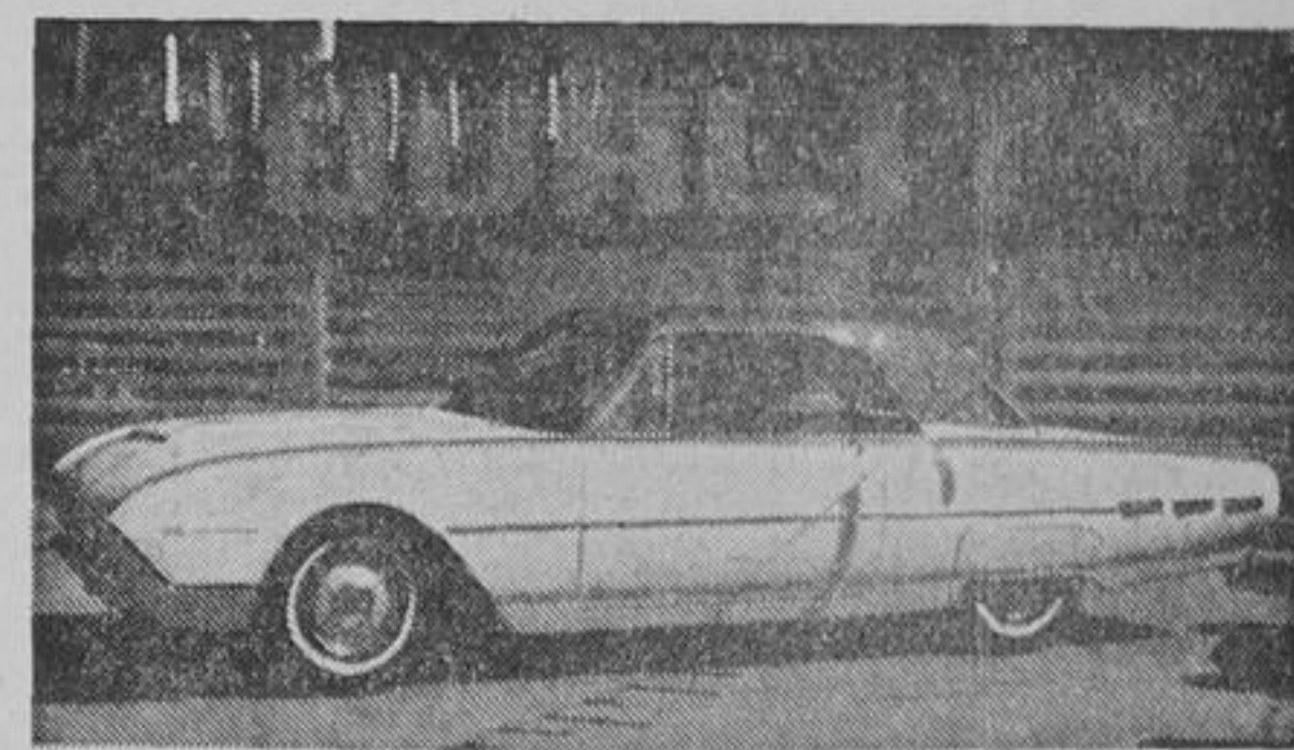
1962 THUNDERBIRD LANDEAU

LOOK AT THE SMALL DIFFERENCE YOU PAY FOR A GUARANTEED QUALITY USED CAR