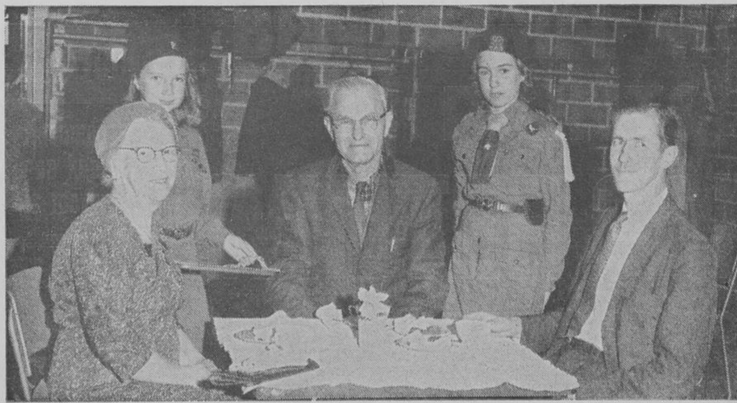
Enjoying A Cup Of Tea At Fun Fair