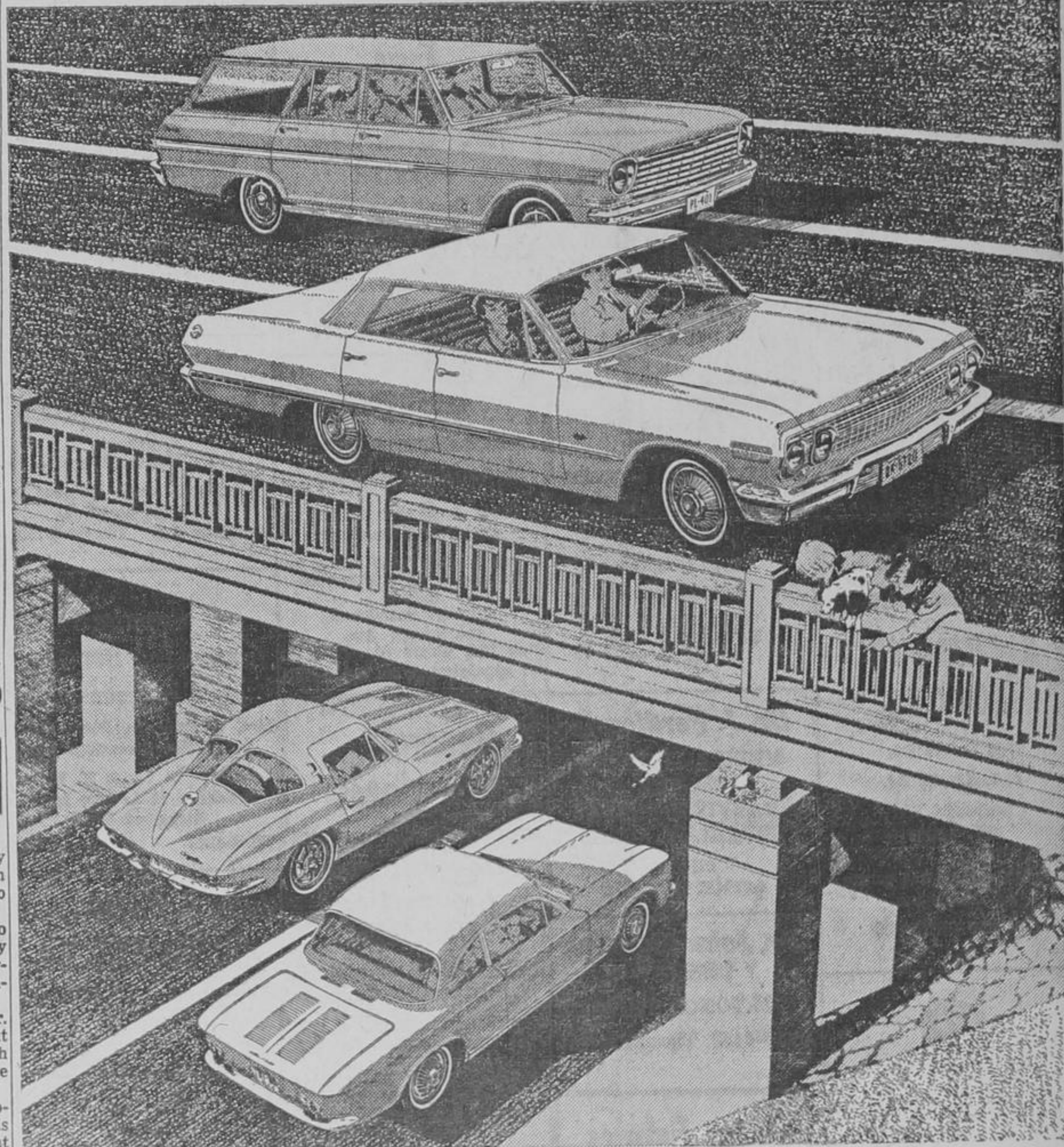
Shown above (top to bottom), '63 Chevy II Nova 400 Station Wagon, Chevrolet Impala Sport Sedan, Corvette Sting Ray Sport Coupe and Corvair Monza Club Coupe.

These four different cars are alike in one very important way. Each is a Chevrolet. That means any one will give you more for your money in performance, beauty and comfort... plus far greater worth at trade-in time. However, each of these fine cars has its own way of being distinctive, too, because each is tailored to the interest of a certain kind of buyer. There's our big CHEVROLET Keeps Going Great Chevrolet with its Jet-smooth ride, luxury and styling. Chevy II with its parkable size, sparkling performance and outstanding fuel economy. Corvair with rear engine manoeuvrability and the instincts of a sports car. And the new Corvette Sting Ray, North America's most exciting car. So, whichever your choice, you can be sure it's a wise one.