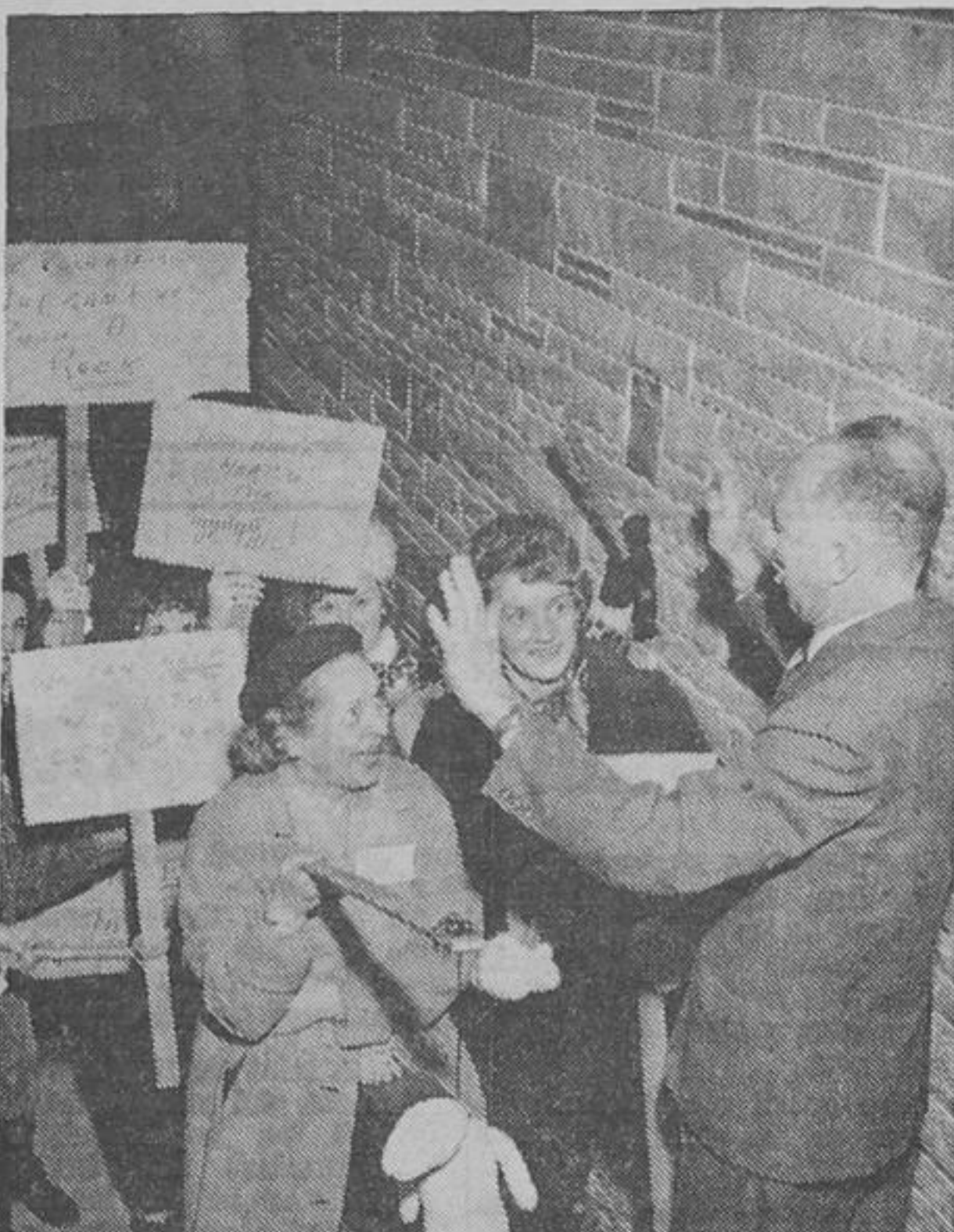
Ladies Protest Vigorously

Weston 8 Barrymore Rugs 4 The CFGM kids downed Don Mills 3-2 last Friday night in Richmond Hill.