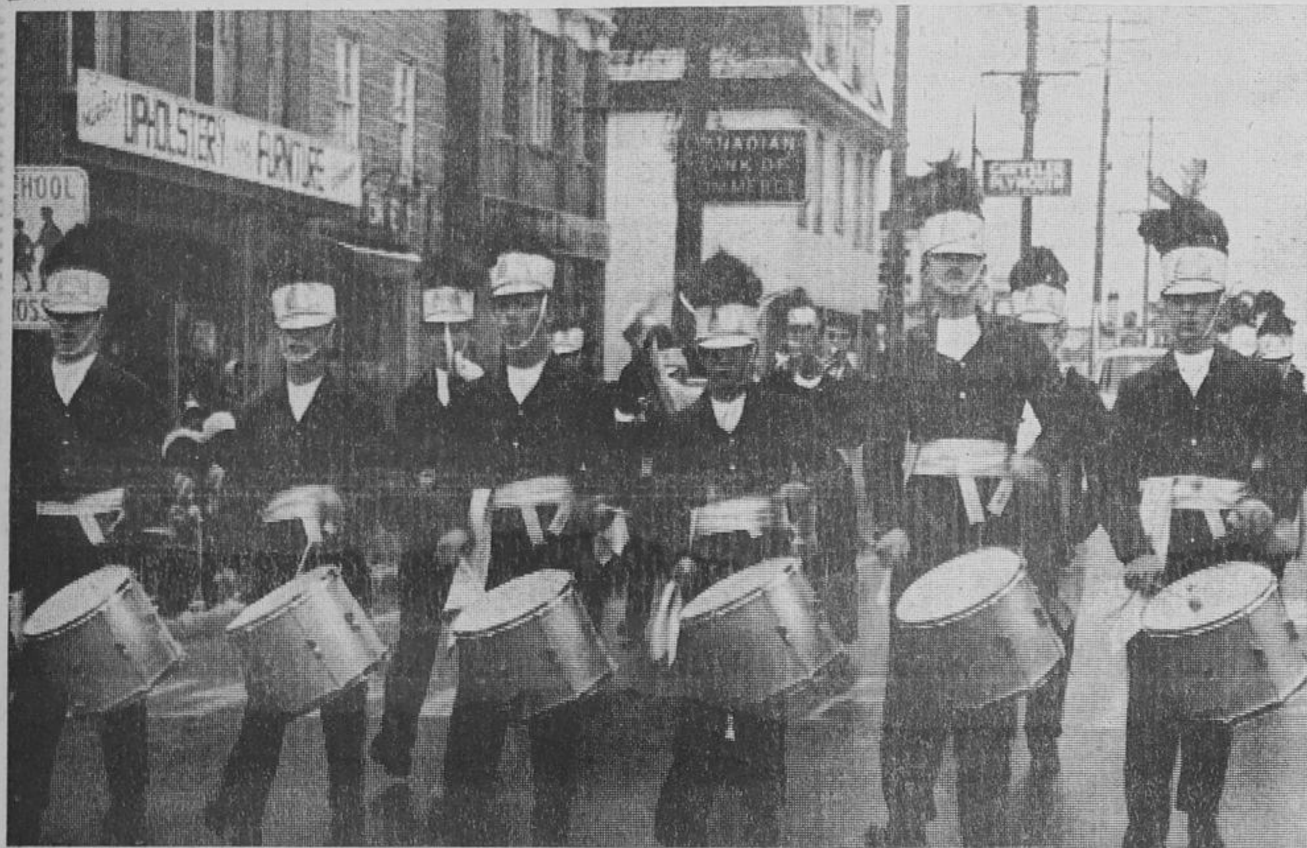
Hilltoppers, Majorettes Perform Well

The Richmond Hill Police Intermediate Majorettes Corps, top, and the Hilltoppers Drum Corps, thrilled the crowd with their performance in Saturday's parade.