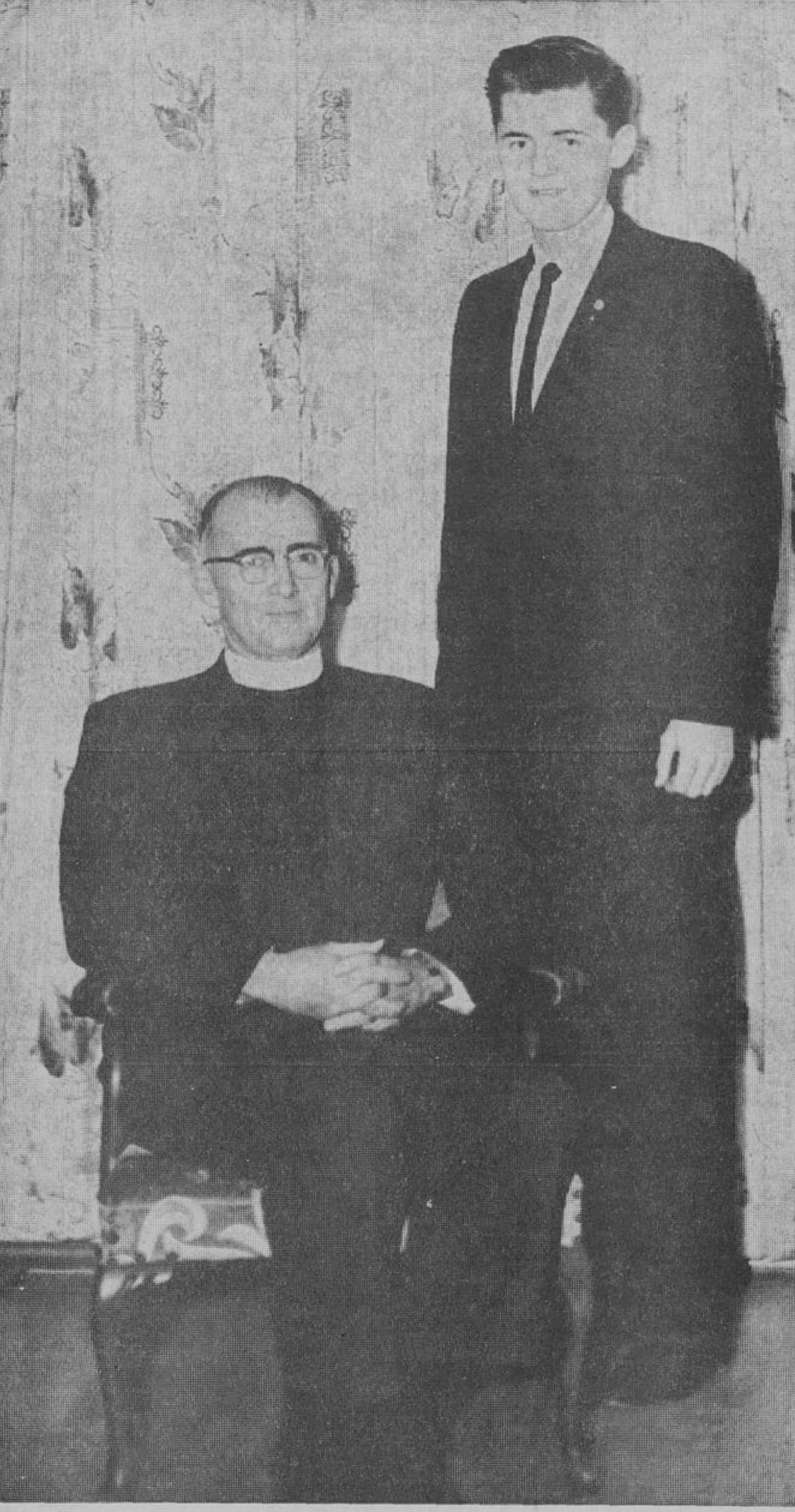
St. Matthew's Church Observes Laymen's Sunday

Students who attend on Friday (reduced prices for students - 75c) will have the opportunity of discussing the play with the cast afterwards; they're going to throw open the curtains and invite questions from the audience.