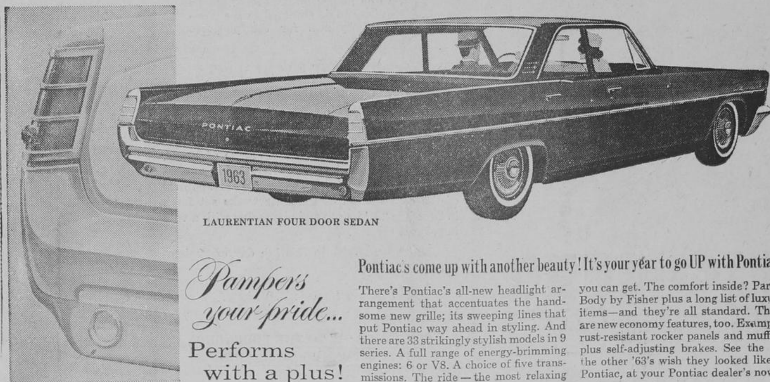
LAFontaine FOUR DOOR SEDAN

Here's what the other '63's wish they looked like!