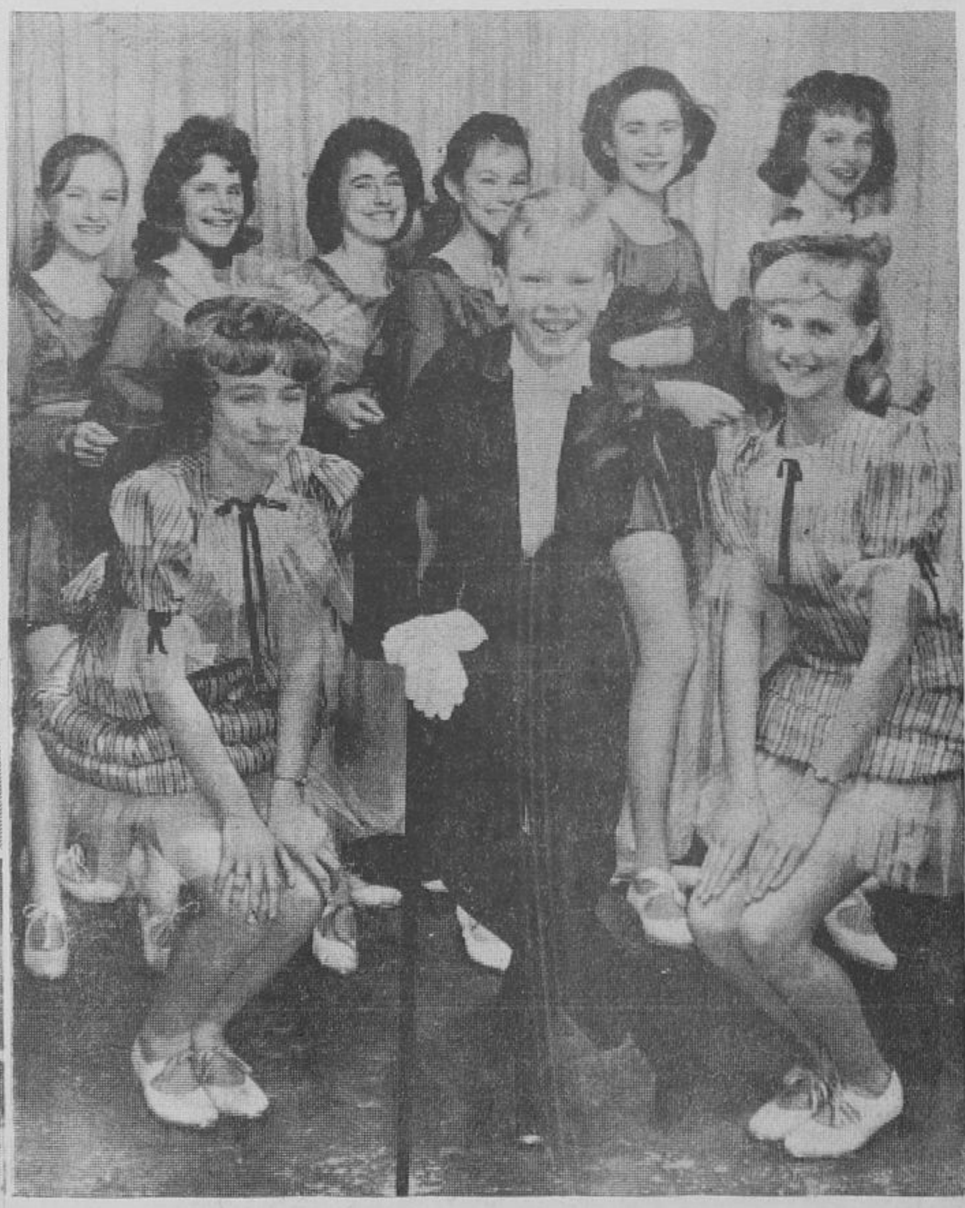
Pictured above are students of Midmer Dance Academy who will appear on Channel 11 this Sunday.