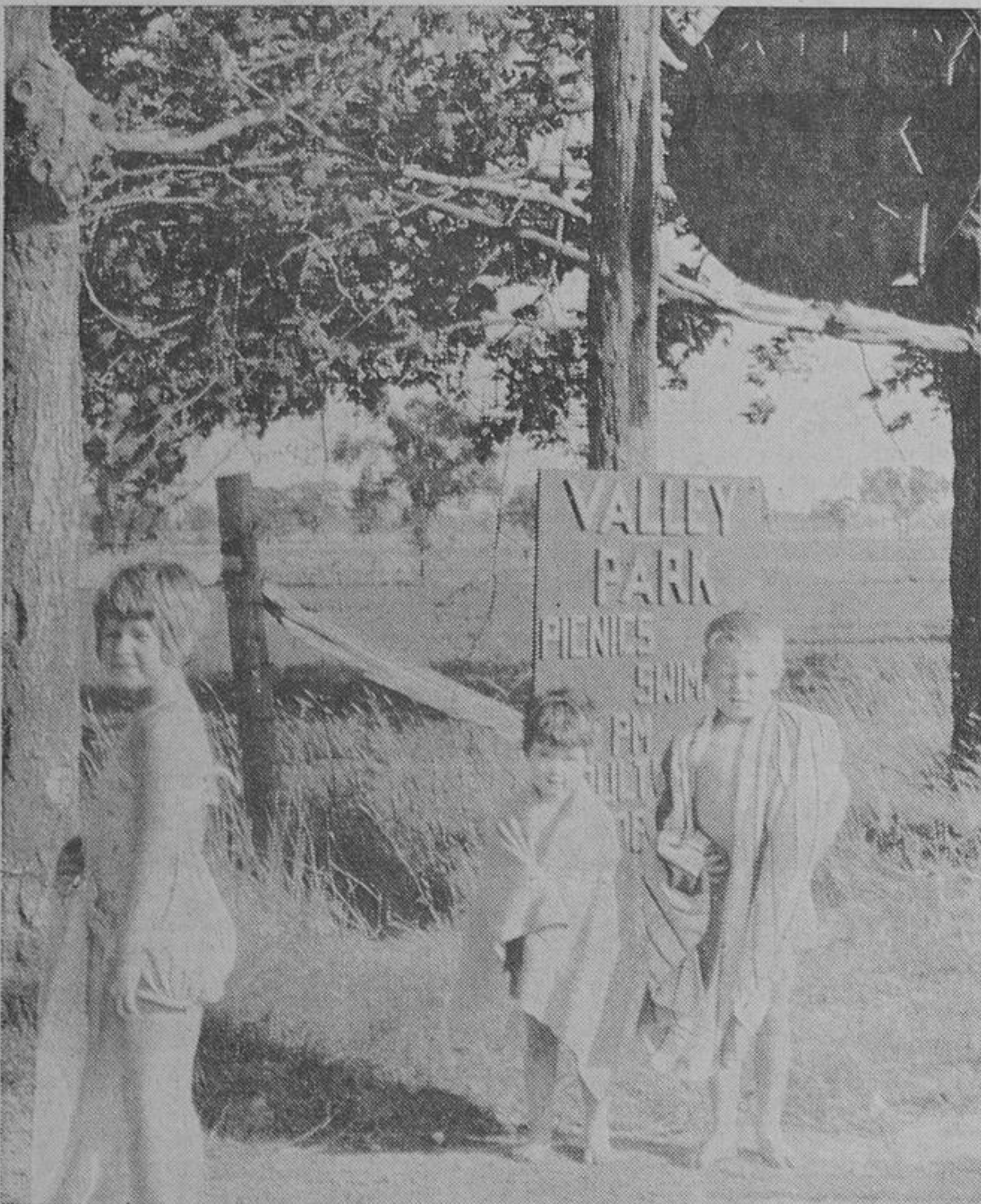
ENJOYING THE WATER AT VALLEY PARK