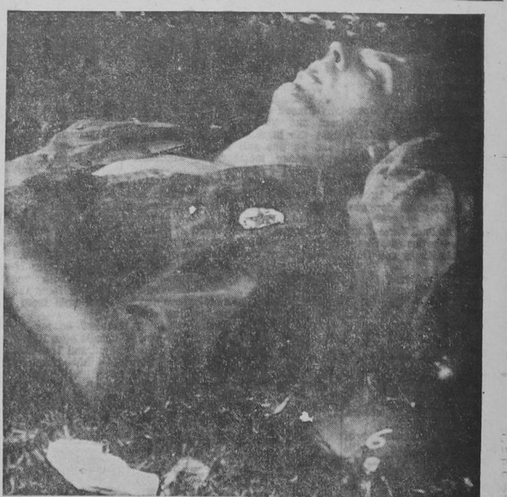
TIRED FIREMAN SLEEPS AT SCENE

Police and Fire Chiefs, Metro inspectors, newsmen and the men manning brooms, cleaning up debris, all held their breath (me included) as we watched a scrawny cat stalk a mouse among the broken glass and metal. As if on cue, a cheer went up from the men as the cat made its final pounce and proudly marched off with its catch. That one cheer perhaps released more pent-up tension for everyone for the first time since IT happened.