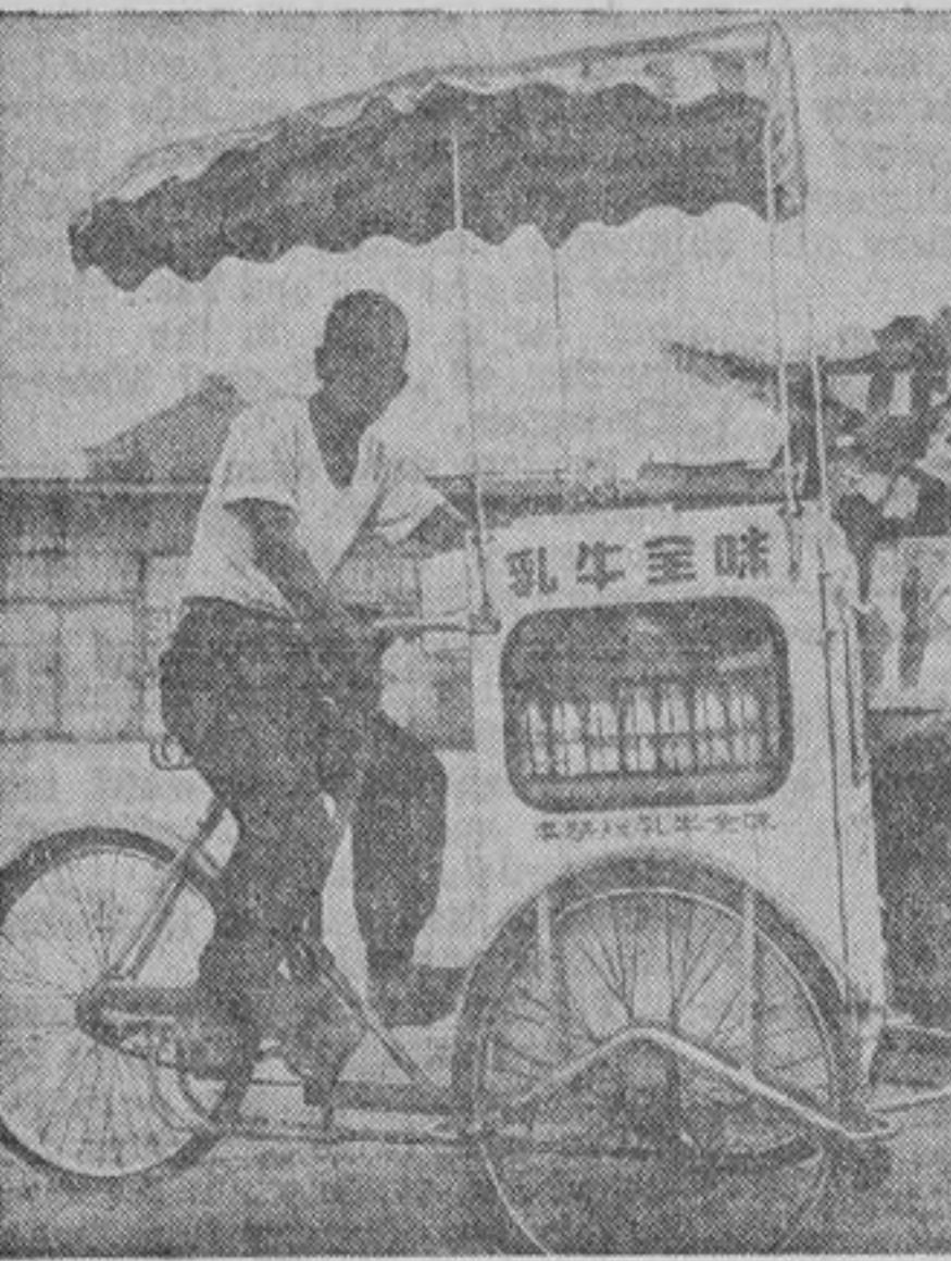
Milkman makes rounds on bike.