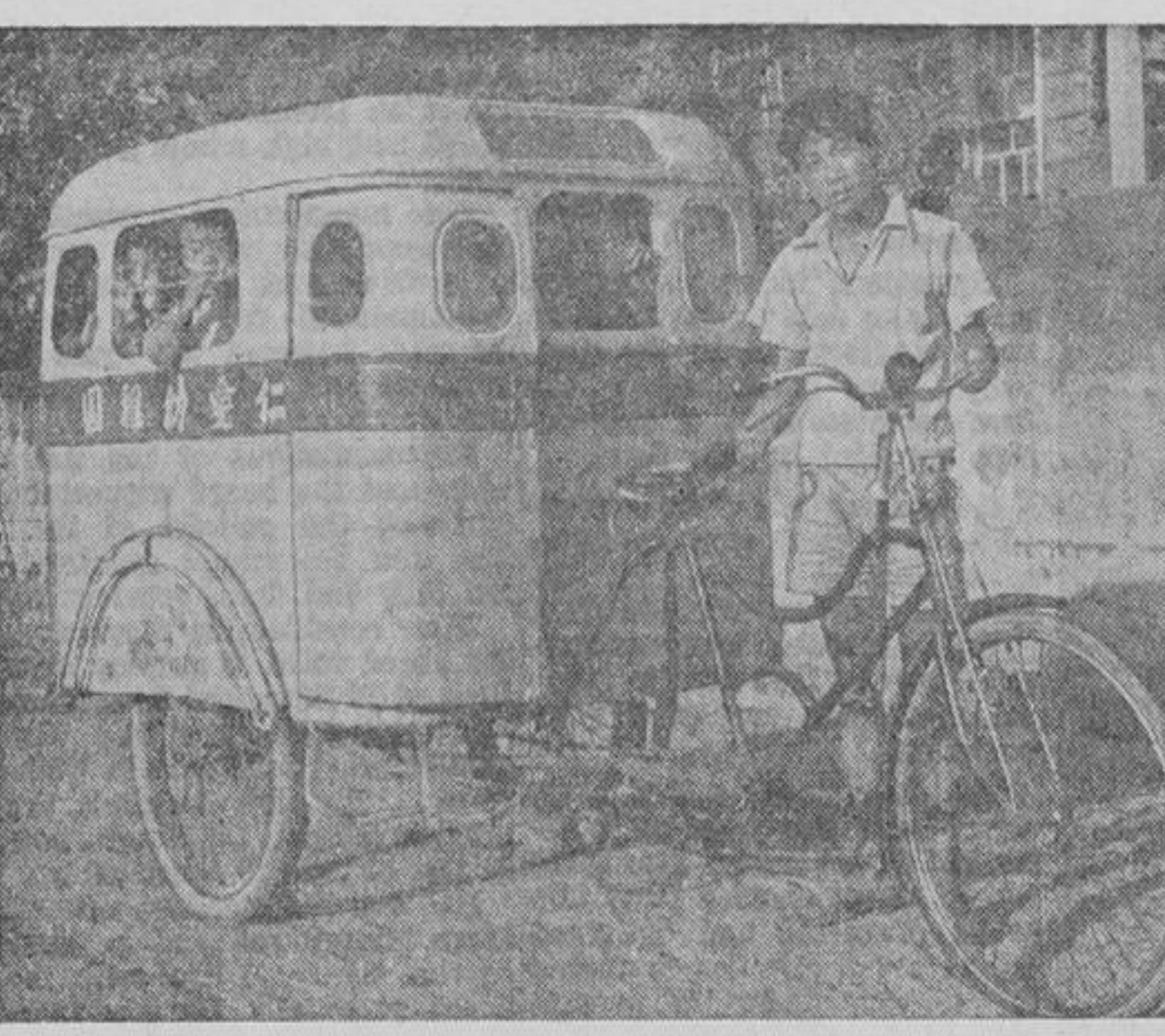
Unusual school bus is part bike.