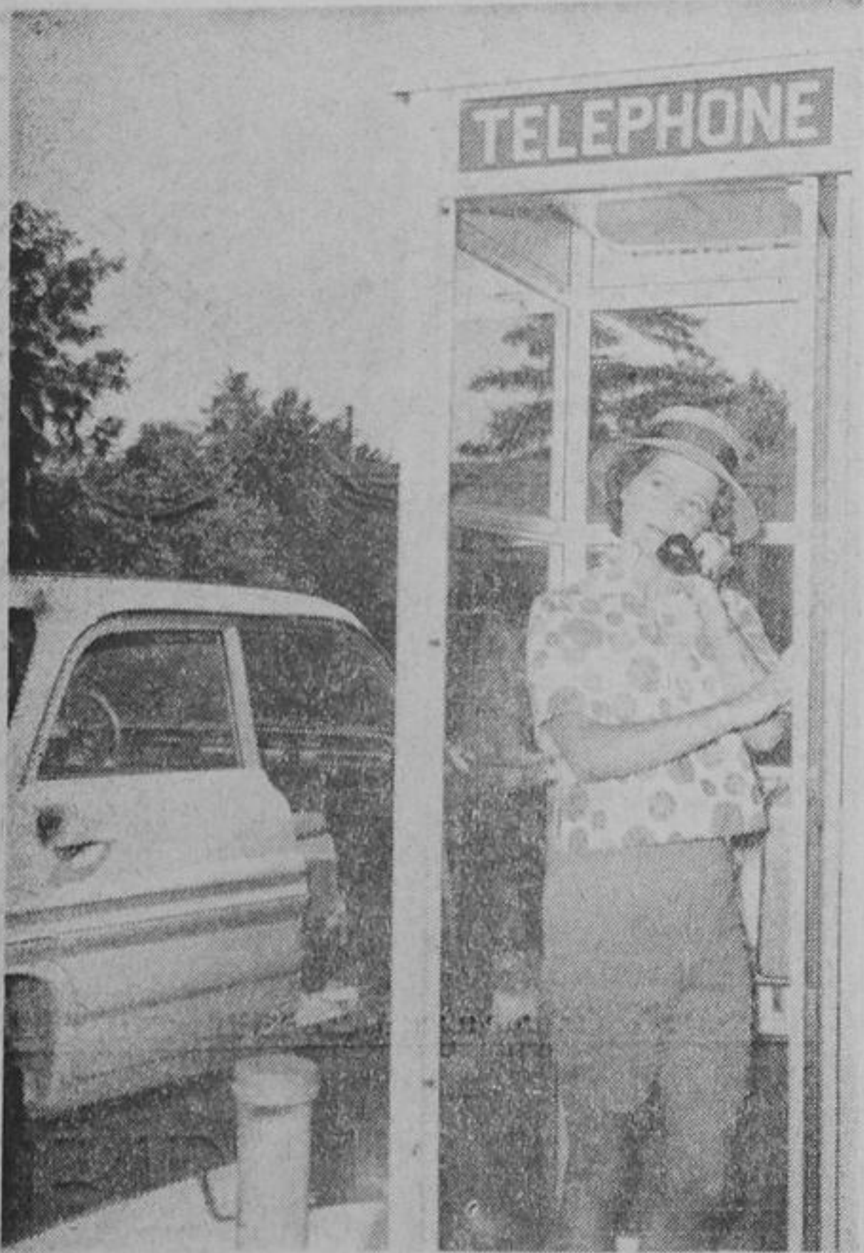
Mrs. Pengelly of Willowdale says that you can travel relaxed if you call ahead for accommodations.